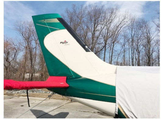
Piper Malibu/Mirage Horizontal Stabilizer/Tailcone Cover