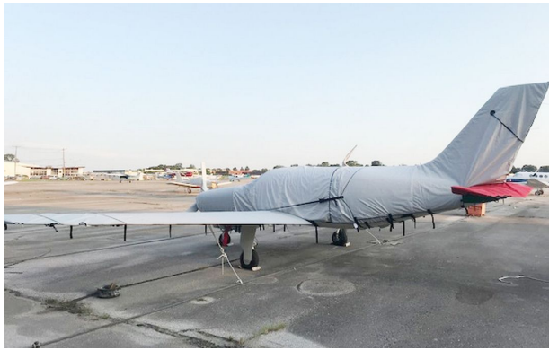
Piper Malibu, Mirage, Meridian Extended Canopy, Engine, Empennage & Wing Covers.

WINTER USE MATERIAL - Made with Solution-Dyed Polyester fabric, this option is intended for seasonal use to aid in deicing, rain mitigation, or for occasional travel. The material is lighter and more compact, but more susceptible to UV damage and may have a shorter useful life if used continuously outside than the all-year use material.