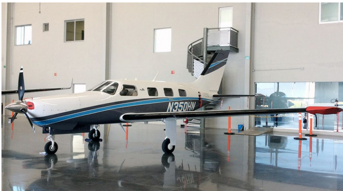
Piper PA-46 Malibu Wingtip Pads

Designed to prevent damage to the aircraft extremities in crowded hangars, these products are made of bright red Naugahyde and thickly padded with a sandwich of closed cell foam.