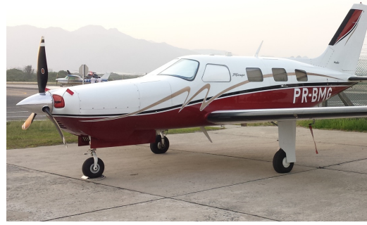
Piper Malibu/Mirage Engine Plugs, Cockpit HeatShields