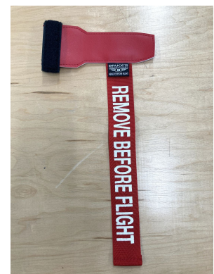
Pitot Tube Cover