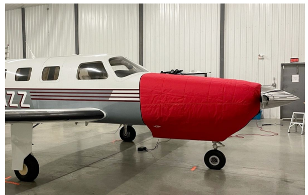
Malibu PA-46-310P Insulated Engine Cover