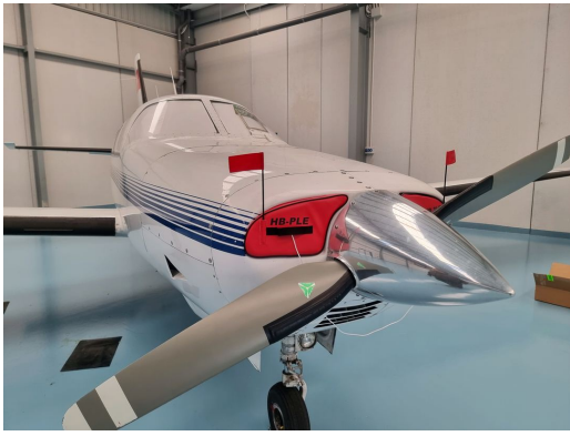
Piper PA-46 Malibu Engine Inlet Plugs