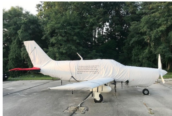
Piper Malibu, Mirage, Meridian Extended Canopy, Engine, Empennage & Wing Covers.