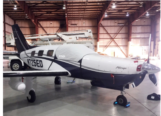
Piper Malibu/Mirage Cockpit Cover, Engine Plugs