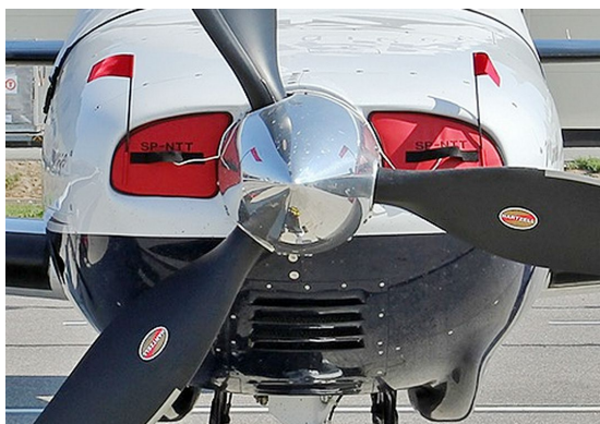
Piper PA-46-350P Mirage Engine Inlet Plugs

Engine Inlet Plugs are custom fit for your Piper PA-46-350P Mirage, Matrix, JetProp intakes, made with heavy-duty vinyl material, and stuffed with a single block of sculpted urethane foam. Each plug has a zipper that allows the foam to be removed and dried if necessary. Engine plugs have warning flags that are visible from the cockpit or 'remove before flight' streamers sewn onto the face of the plugs. Most plugs are imprinted with the aircraft registration number in black for an extra charge. Storage bag NOT included. Engine plugs may be inserted after flight when the engine is still warm. Engine Inlet Plugs are commonly referred to as Cowl Plugs, Intake Plugs, Cowl Blocks, Engine Blocks, and Engine Bungs.