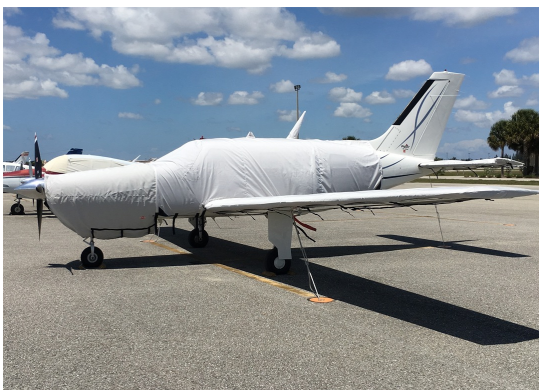
Piper Malibu Extended Canopy Cover, Engine, Wing & Horiz. Stab. Covers

This cover type is made from Silver Acrylic Sunbrella canvas and is 100% lined with a soft and smooth microfiber. Bruce's Custom Covers developed this material combination especially for aircraft protection. The outer material is medium weight and treated for water resistance, UV resistance and anti-static buildup. The inner lining is a very soft and smooth microfiber to prevent scratching. The material is very reflective, and tests show that the cabin interior temperature can be reduced to near-ambient temperature on the hottest of days. It is water, ice and snow repellent, yet breathable to allow moisture to escape from between the cover and the aircraft surface.