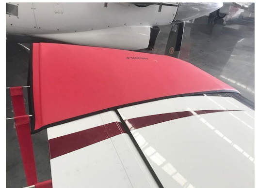
Piper Meridian Wingtip Pads, M600 Models