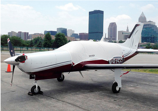
Piper Mirage Canopy Cover, Engine Plugs

Travel Covers are made with Silver Solution-Dyed Polyester fabric and only lined over the windshield to save weight. The material is lightweight and more compact for easy stowage in the aircraft. The polyester material is water resistant, but only intended for occasional use outside. We also have an ultra lightweight material available for fitted hangar dust covers. For daily outdoor use, the non-travel Sunbrella Cover is the best choice.