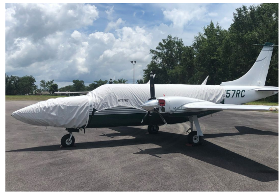
Piper Aerostar Canopy & Nose Covers, Engine Plugs