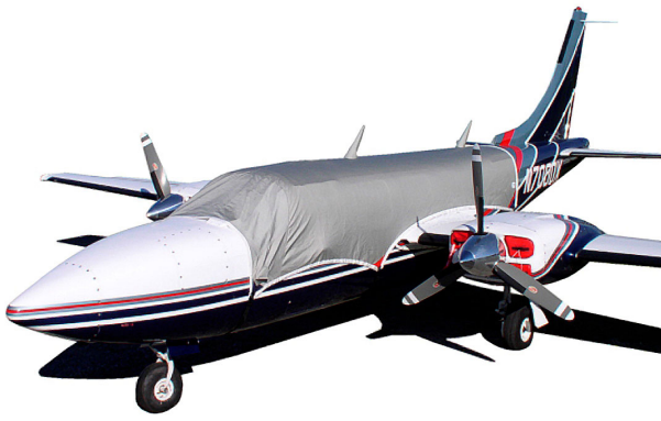
Aerostar Canopy Cover & Plugs