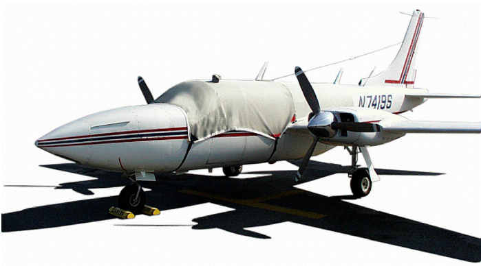
Aerostar Canopy Cover