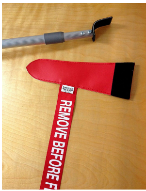
Piper Aerostar Pitot Cover and Installation Tool