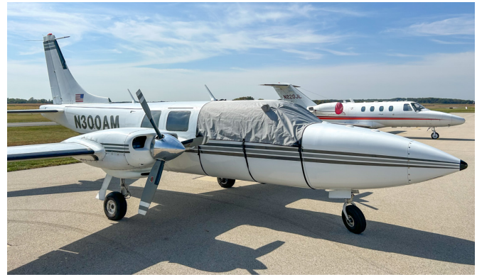
AEROSTAR 601P Travel Cover, Light Weight Travel Cockpit/Skylights Cover