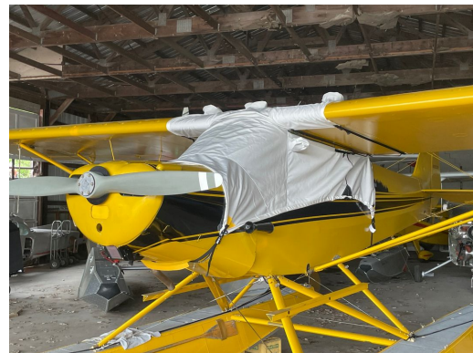
Piper PA-11 Over-Top Canopy Cover, extends to cover gas caps