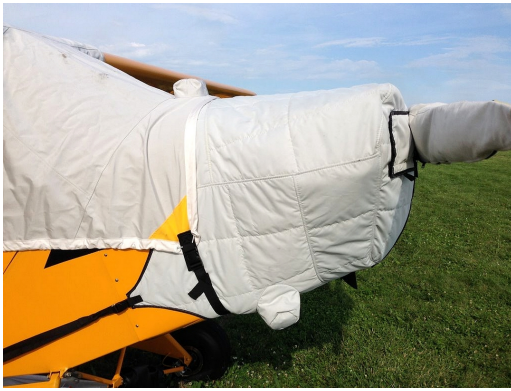
Piper J-3 Cub Insulated Engine Cover with added Pre-heater Access Flaps