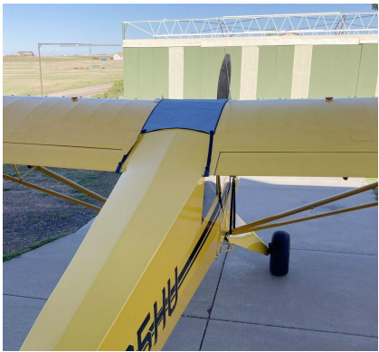
Aviat Husky Windshield/Skylight Cover