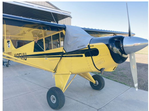
Aviat Husky Windshield/Skylight Cover