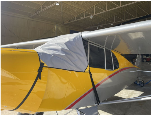
Piper PA-18 Windshield/Skylight Cover

the hottest of days. It is water, ice and snow repellent, yet breathable to allow moisture to escape from between the cover and the aircraft surface.