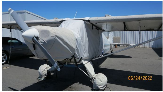
Piper PA-12 Over-Top Canopy Cover, Engine, Wing & Landing Gear Covers