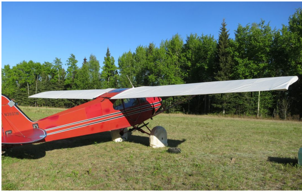
Piper PA-12 Wing Covers