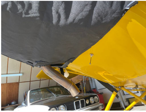
Piper PA-11 Replica Insulated Engine Cover