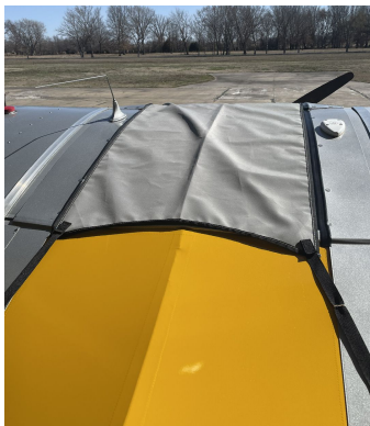
Piper PA-18 Windshield/Skylight Cover

This cover type is made from Silver Acrylic Sunbrella canvas and is 100% lined with a soft and smooth microfiber. Bruce's Custom Covers developed this material combination especially for aircraft protection. The outer material is medium weight and treated for water resistance, UV resistance and anti-static buildup. The inner lining is a very soft and smooth microfiber to prevent scratching. The material is very reflective, and tests show that the cabin interior temperature can be reduced to near-ambient temperature on the hottest of days. It is water, ice and snow repellent, yet breathable to allow moisture to escape from between the cover and the aircraft surface.