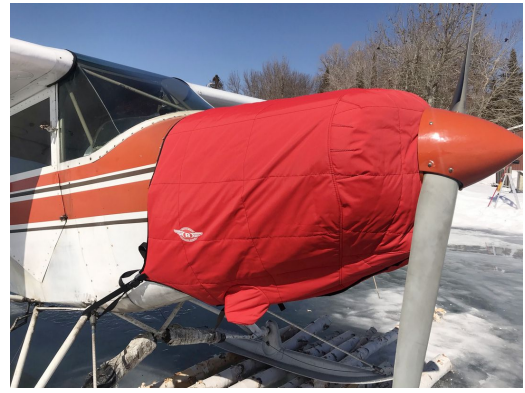
Piper PA-12 Insulated Engine Cover