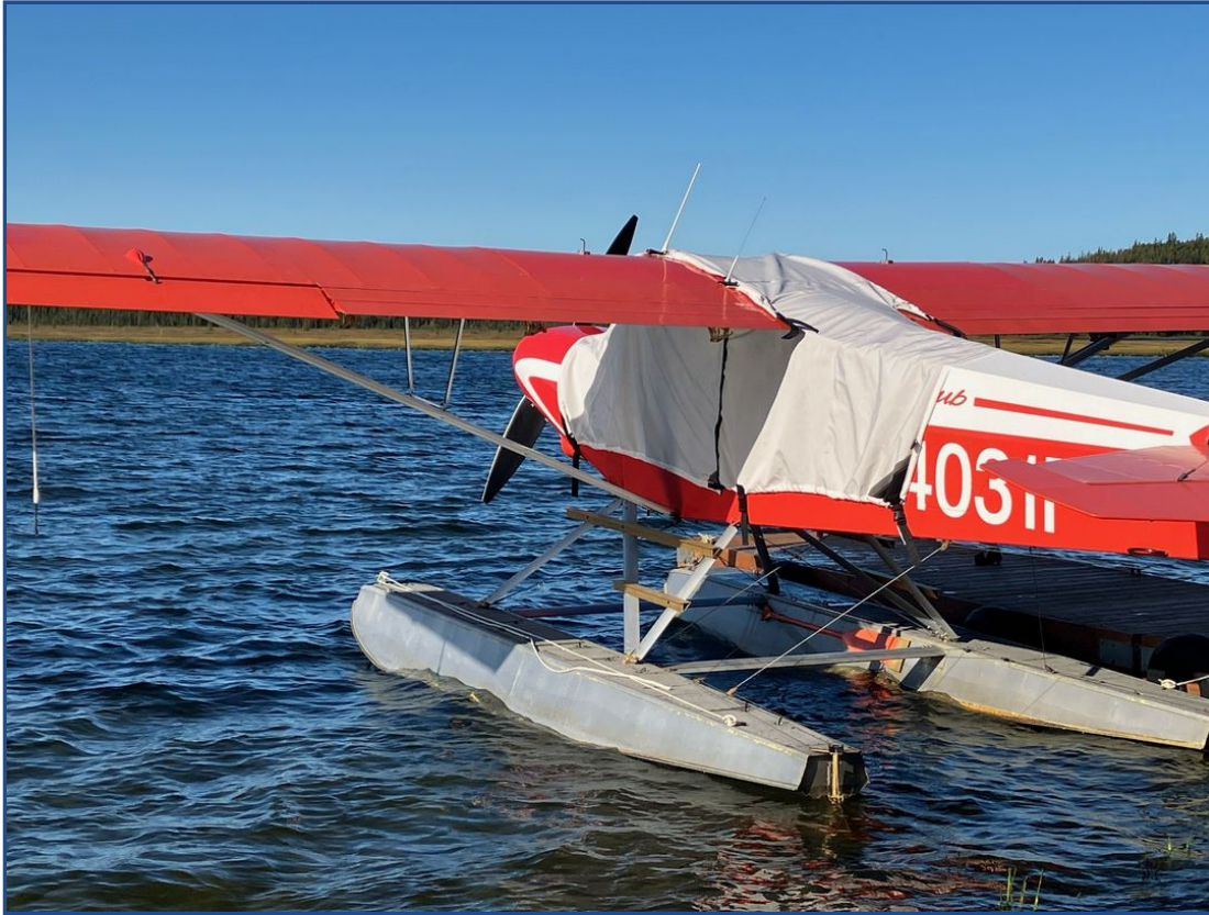
Piper PA-18 Super Cub Canopy Cover, Over Top Type