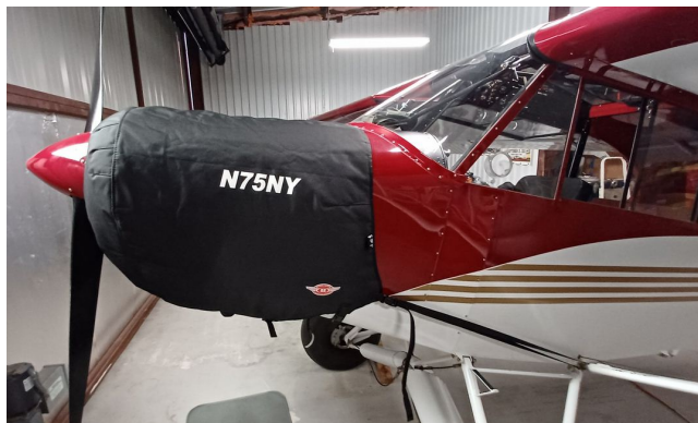
Piper PA-18 Super Cub Insulated Engine Cover