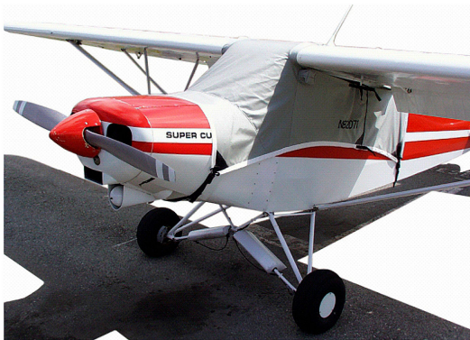
Piper PA-18 Super Cub Canopy Cover

This cover type is made from Silver Acrylic Sunbrella canvas and is 100% lined with a soft and smooth microfiber. Bruce's Custom Covers developed this material combination especially for aircraft protection. The outer material is medium weight and treated for water resistance, UV resistance and anti-static buildup. The inner lining is a very soft and smooth microfiber to prevent scratching. The material is very reflective, and tests show that the cabin interior temperature can be reduced to near-ambient temperature on the hottest of days. It is water, ice and snow repellent, yet breathable to allow moisture to escape from between the cover and the aircraft surface.