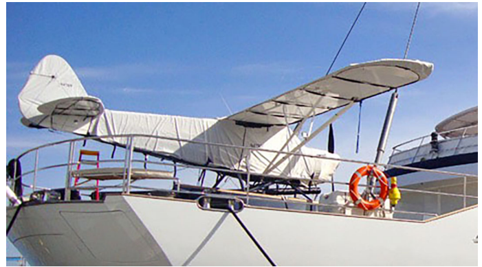
Piper PA-18 Super Cub Complete Cover set