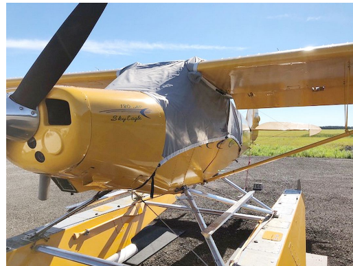
Sportsman 2+2 Wag Aero Light Weight Over the Top Travel Canopy Cover