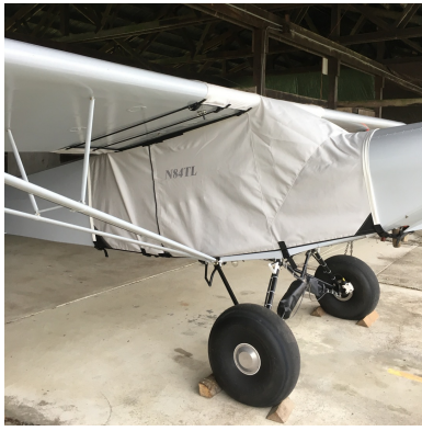
Piper PA-18 Replica Extended Canopy Cover