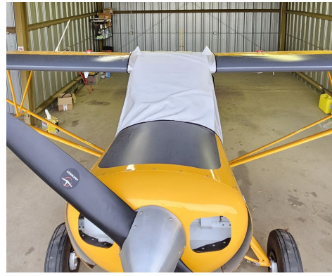
Piper PA-12: Super Cruiser, J5 Cub Windshield/Skylight Cover