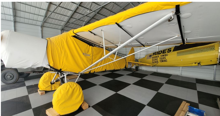
Piper PA-18 Complete Cover Set

ALL-YEAR USE MATERIAL - Made with Silver Acrylic Sunbrella canvas, the all-year use material is the best option for sun protection and cover longevity. This heavier more durable material is intended for all weather conditions, such as rain and snow or lots of sun.