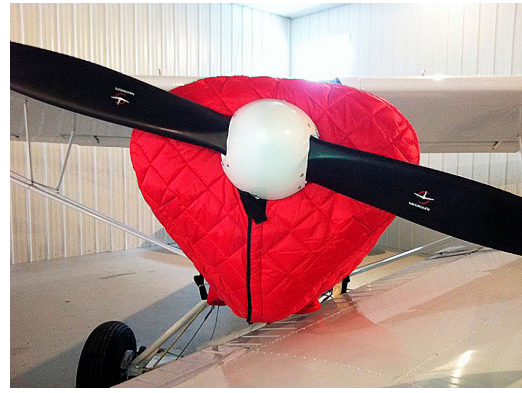
Piper PA-18 Super Cub Insulated Engine Cover