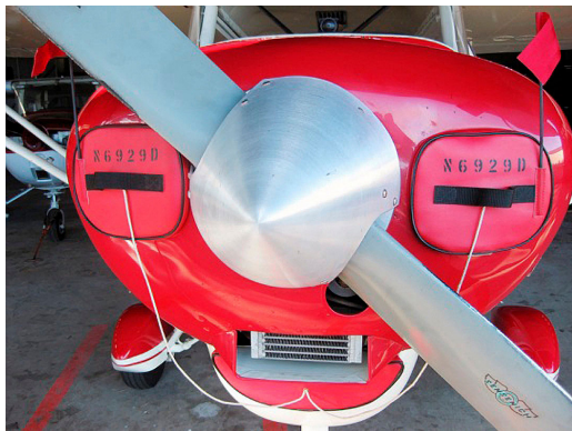
Piper PA-22-150 Engine Inlet Plugs (set of 3)

Engine Inlet Plugs are custom fit for your Piper Clipper, Pacer, Tri-Pacer, Vagabond, Colt: PA-15, 16, 20, 22 intakes, made with heavy-duty vinyl material, and stuffed with a single block of sculpted urethane foam. Each plug has a zipper that allows the foam to be removed and dried if necessary. Engine plugs have warning flags that are visible from the cockpit or 'remove before flight' streamers sewn onto the face of the plugs. Most plugs are imprinted with the aircraft registration number in black for an extra charge. Storage bag NOT included. Engine plugs may be inserted after flight when the engine is still warm. Engine Inlet Plugs are commonly referred to as Cowl Plugs, Intake Plugs, Cowl Blocks, Engine Blocks, and Engine Bungs.