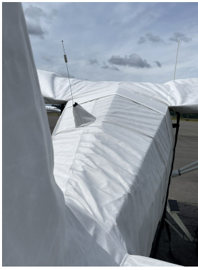
Piper PA-22 Tri-Pacer Empennage Cover