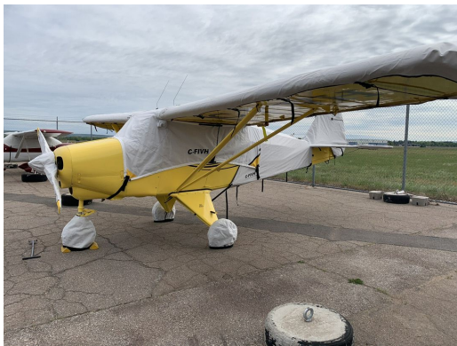
Piper PA-22 Tri-Pacer Cover Set

This cover type is made from Silver Acrylic Sunbrella canvas and is 100% lined with a soft and smooth microfiber. Bruce's Custom Covers developed this material combination especially for aircraft protection. The outer material is medium weight and treated for water resistance, UV resistance and anti-static buildup. The inner lining is a very soft and smooth microfiber to prevent scratching. The material is very reflective, and tests show that the cabin interior temperature can be reduced to near-ambient temperature on the hottest of days. It is water, ice and snow repellent, yet breathable to allow moisture to escape from between the cover and the aircraft surface.