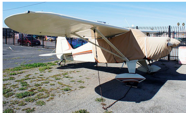
Piper PA-20 Extended Canopy Cover, Wing Covers Piper PA-22-150 Pacer Extended Canopy, Engine & Prop/Spinner Covers