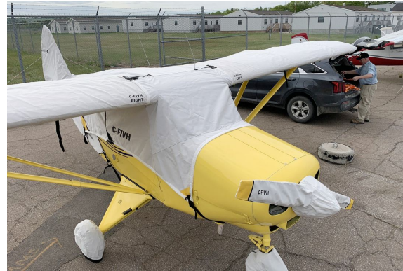
Piper PA-22 Tri-Pacer Cover Set