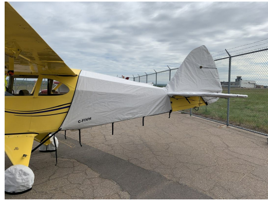
Piper PA-22 Tri-Pacer Empennage Cover