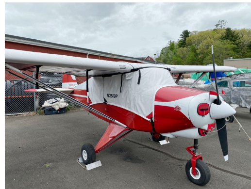
Piper Tri-Pacer PA22-150 Canopy & Wing Covers, Engine Plugs