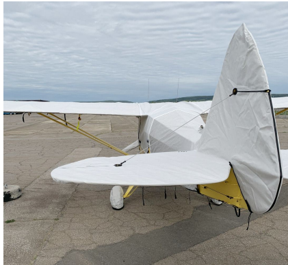
Piper PA-22 Tri-Pacer Empennage Cover

ALL-YEAR USE MATERIAL - Made with Silver Acrylic Sunbrella canvas, the all-year use material is the best option for sun protection and cover longevity. This heavier more durable material is intended for all weather conditions, such as rain and snow or lots of sun.