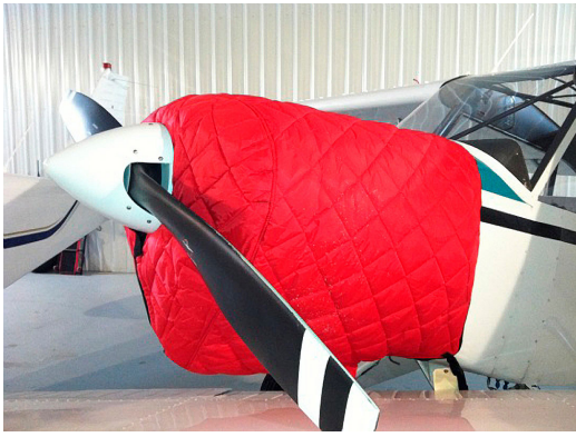
Piper Super Cub Insulated Engine Cover