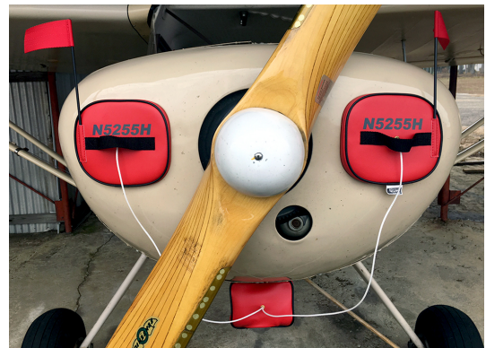
Piper PA-16 Engine Inlet Plugs