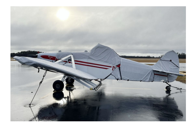
Piper Pawnee Canopy/Hopper, Wing & Empennage Covers

WINTER USE MATERIAL - Made with Solution-Dyed Polyester fabric, this option is intended for seasonal use to aid in deicing, rain mitigation, or for occasional travel. The material is lighter and more compact, but more susceptible to UV damage and may have a shorter useful life if used continuously outside than the all-year use material.