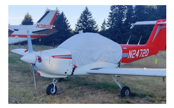
Piper PA-38 Tomahawk Canopy Cover

This cover type is made from Silver Acrylic Sunbrella canvas and is 100% lined with a soft and smooth microfiber. Bruce's Custom Covers developed this material combination especially for aircraft protection. The outer material is medium weight and treated for water resistance, UV resistance and anti-static buildup. The inner lining is a very soft and smooth microfiber to prevent scratching. The material is very reflective, and tests show that the cabin interior temperature can be reduced to near-ambient temperature on the hottest of days. It is water, ice and snow repellent, yet breathable to allow moisture to escape from between the cover and the aircraft surface.