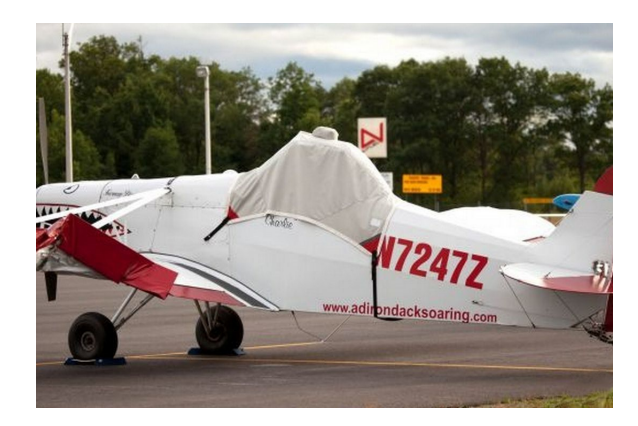
Piper Pawnee Canopy Cover