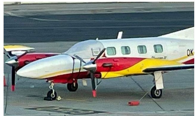
Piper PA-42 Cheyenne III Cockpit Cover