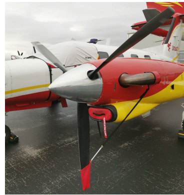
Piper PA-42 Cheyenne III Prop Tie/Exhaust Cover, Inlet Plugs