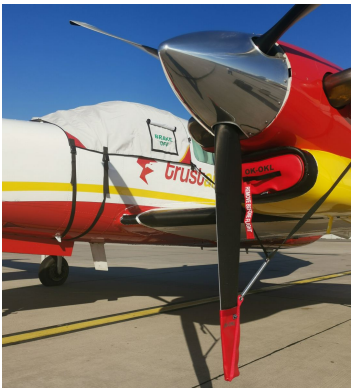
Piper PA-42 Cheyenne III Prop Tie/Exhaust Cover, Inlet Plugs Piper PA-42 Cheyenne III Engine Plugs, Prop Ties, Cockpit Cover