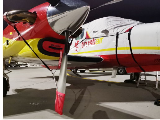
Piper PA-42 Cheyenne III Cockpit Cover, Prop Tie/Exhaust Cover, Inlet Plugs