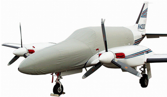
Piper Navajo CR Canopy/Nose Cover

This cover type is made from Silver Acrylic Sunbrella canvas and is 100% lined with a soft and smooth microfiber. Bruce's Custom Covers developed this material combination especially for aircraft protection. The outer material is medium weight and treated for water resistance, UV resistance and anti-static buildup. The inner lining is a very soft and smooth microfiber to prevent scratching. The material is very reflective, and tests show that the cabin interior temperature can be reduced to near-ambient temperature on the hottest of days. It is water, ice and snow repellent, yet breathable to allow moisture to escape from between the cover and the aircraft surface.