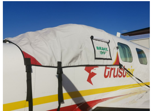
Piper PA-42 Cheyenne III Cockpit Cover