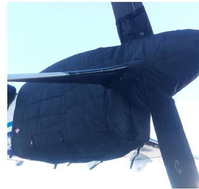
Piper PA-42 Cheyenne III Cockpit Cover, Prop Tie/Exhaust Cover, Inlet Plugs ATR-72-202 Insulated Engine & Prop Hub Covers