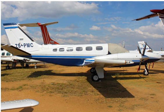
Cessna 441 Conquest II Cockpit Cover

This cover type is made from Silver Acrylic Sunbrella canvas and is 100% lined with a soft and smooth microfiber. Bruce's Custom Covers developed this material combination especially for aircraft protection. The outer material is medium weight and treated for water resistance, UV resistance and anti-static buildup. The inner lining is a very soft and smooth microfiber to prevent scratching. The material is very reflective, and tests show that the cabin interior temperature can be reduced to near-ambient temperature on the hottest of days. It is water, ice and snow repellent, yet breathable to allow moisture to escape from between the cover and the aircraft surface.