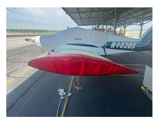
Piper PA-28-140 Wingtip Pads