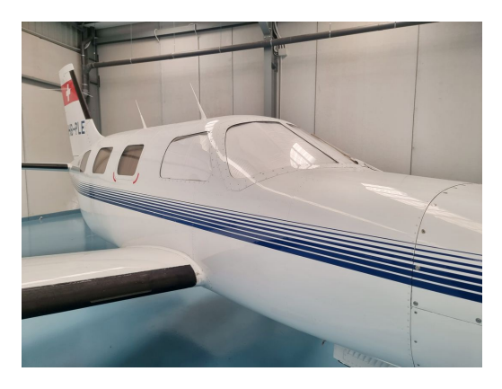
Piper PA-46 Malibu Cockpit Heatshields