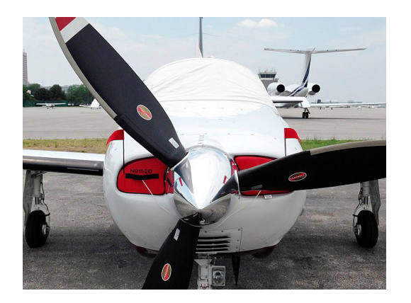
Piper Mirage Engine Plugs