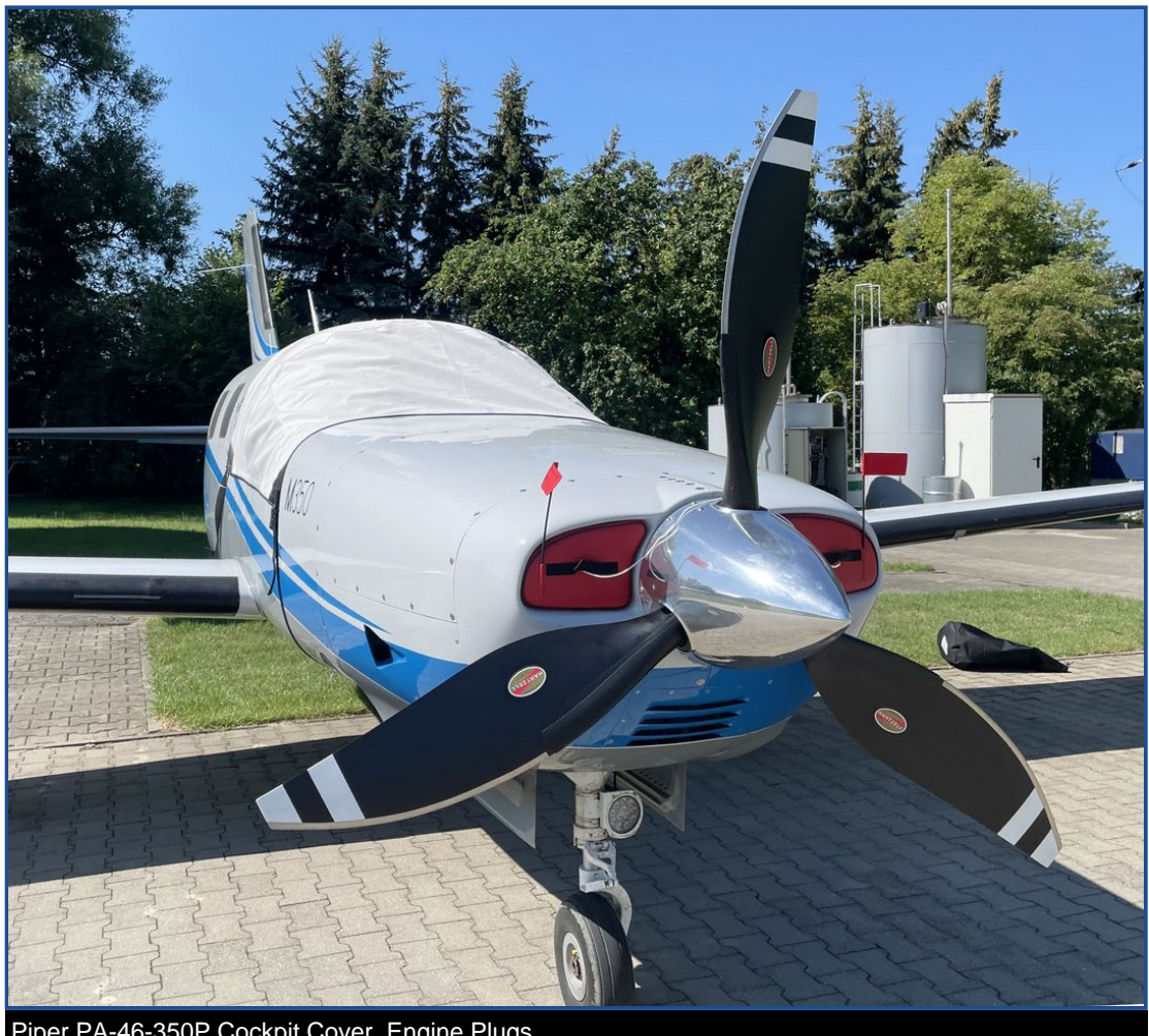
Piper PA-46-350P Cockpit Cover, Engine Plugs