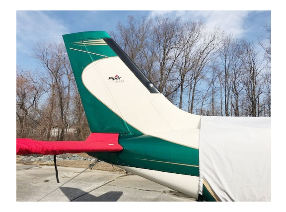
Piper Malibu/Mirage Horizontal Stabilizer/Tailcone Cover

WINTER USE MATERIAL - Made with Solution-Dyed Polyester fabric, this option is intended for seasonal use to aid in deicing, rain mitigation, or for occasional travel. The material is lighter and more compact, but more susceptible to UV damage and may have a shorter useful life if used continuously outside than the all-year use material.