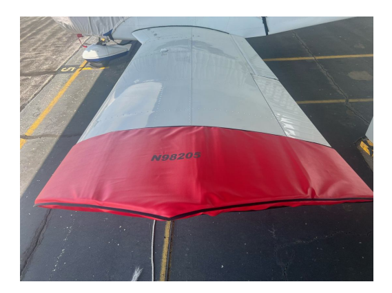
Piper PA-28-140 Wingtip Pads

Designed to prevent damage to the aircraft extremities in crowded hangars, these products are made of bright red Naugahyde and thickly padded with a sandwich of closed cell foam.