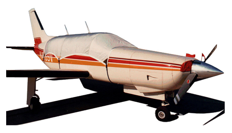
Piper Malibu/Mirage Standard Canopy Cover