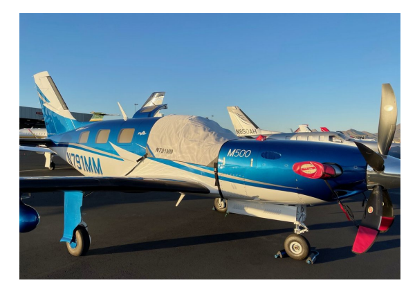
Piper M500 Cockpit Cover

This cover type is made from Silver Acrylic Sunbrella canvas and is 100% lined with a soft and smooth microfiber. Bruce's Custom Covers developed this material combination especially for aircraft protection. The outer material is medium weight and treated for water resistance, UV resistance and anti-static buildup. The inner lining is a very soft and smooth microfiber to prevent scratching. The material is very reflective, and tests show that the cabin interior temperature can be reduced to near-ambient temperature on the hottest of days. It is water, ice and snow repellent, yet breathable to allow moisture to escape from between the cover and the aircraft surface.