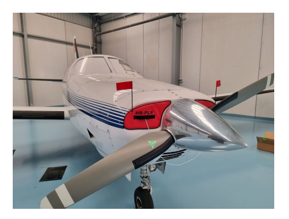
Piper PA-46 Malibu Engine Inlet Plugs

Heatshields are interior sunshades for an aircraft's windows or canopy glass. The product is a unique composite of closed-cell foam with a silver mylar finish. The semi-rigid design is stiff enough to stand along the inside of the windshield using sun visors or window framing. It folds up flat and easily stores in the included storage sleeve. Some designs may require velcro and suction cups. A Heatshield is an excellent short-term remedy for cockpit overheating.