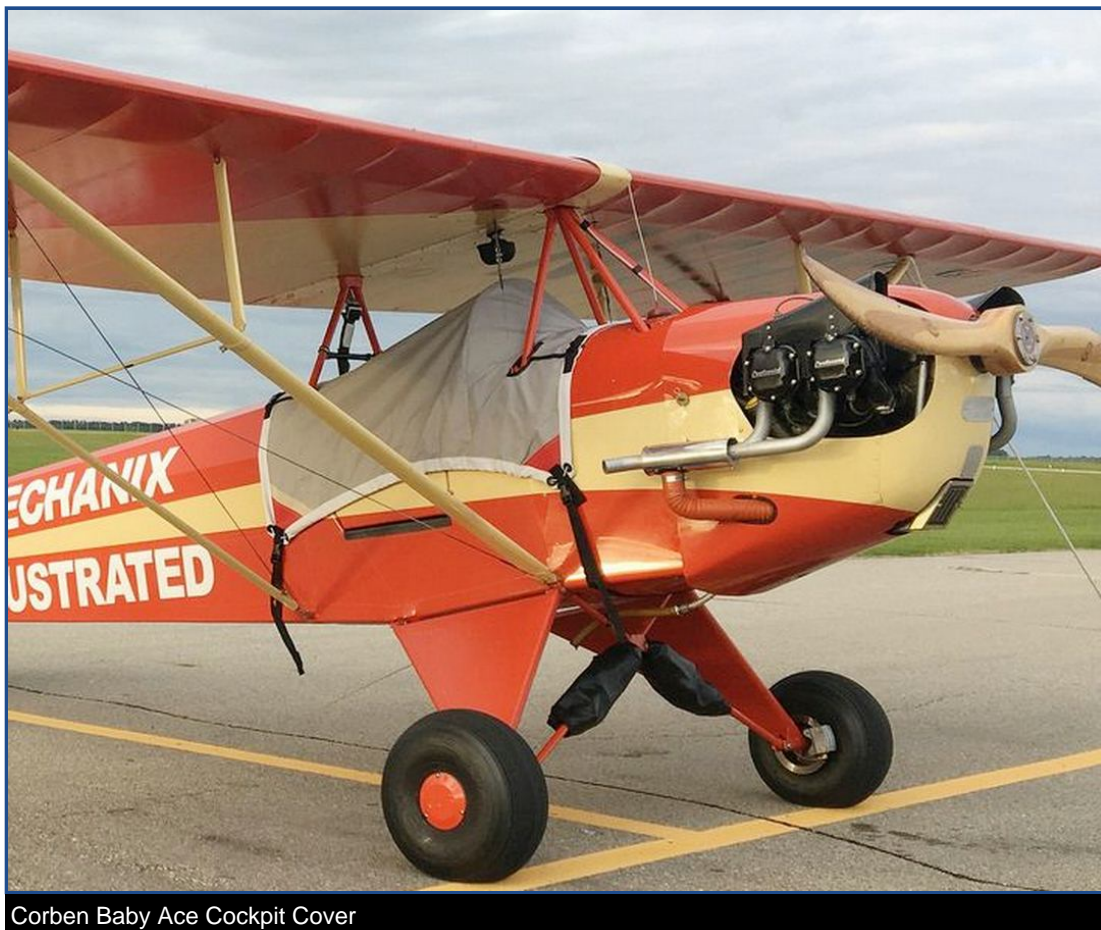
Corben Baby Ace Cockpit Cover