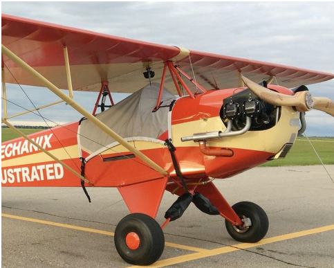
Corben Baby Ace Cockpit Cover

This cover type is made from Silver Acrylic Sunbrella canvas and is 100% lined with a soft and smooth microfiber. Bruce's Custom Covers developed this material combination especially for aircraft protection. The outer material is medium weight and treated for water resistance, UV resistance and anti-static buildup. The inner lining is a very soft and smooth microfiber to prevent scratching. The material is very reflective, and tests show that the cabin interior temperature can be reduced to near-ambient temperature on the hottest of days. It is water, ice and snow repellent, yet breathable to allow moisture to escape from between the cover and the aircraft surface.