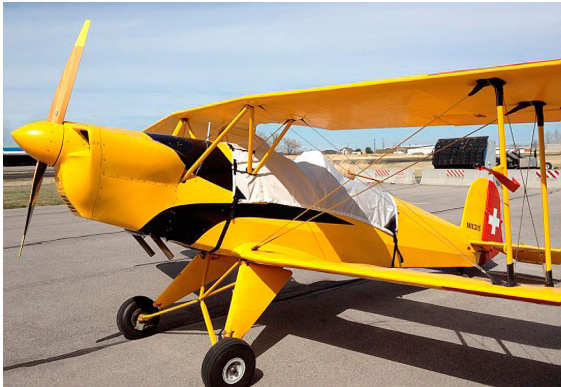
Bucker Jungmann Canopy Cover