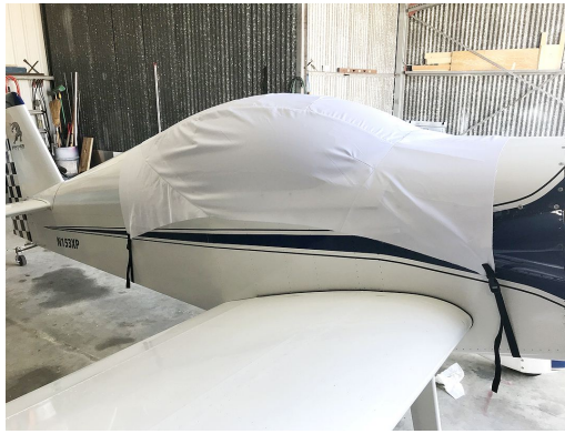
SPA, Sport Performance Aviation, Panther Canopy Cover (test fit cover)