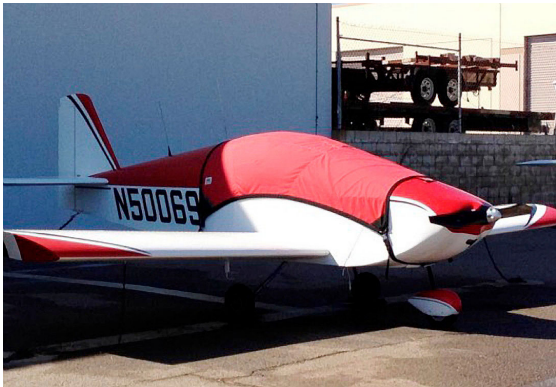
Sonex Canopy Cover