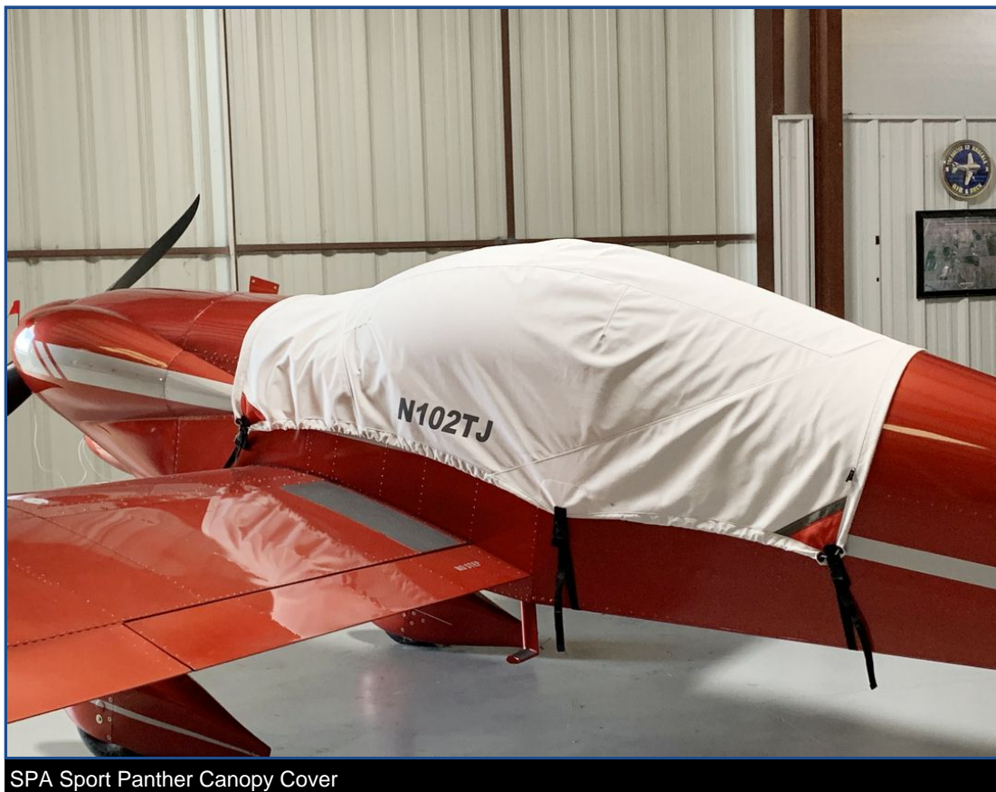
SPA Sport Panther Canopy Cover

(spa-sport-performance-aviation-PAN.pdf)