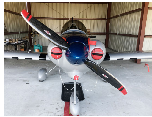
SPA Sport Panther Engine Inlet Plugs