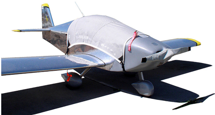
Sonex Canopy Cover

This cover type is made from Silver Acrylic Sunbrella canvas and is 100% lined with a soft and smooth microfiber. Bruce's Custom Covers developed this material combination especially for aircraft protection. The outer material is medium weight and treated for water resistance, UV resistance and anti-static buildup. The inner lining is a very soft and smooth microfiber to prevent scratching. The material is very reflective, and tests show that the cabin interior temperature can be reduced to near-ambient temperature on the hottest of days. It is water, ice and snow repellent, yet breathable to allow moisture to escape from between the cover and the aircraft surface.