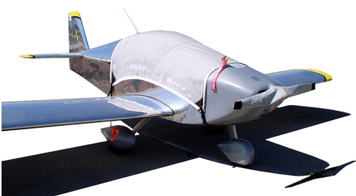
Sonex Canopy Cover

This cover type is made from Silver Acrylic Sunbrella canvas and is 100% lined with a soft and smooth microfiber. Bruce's Custom Covers developed this material combination especially for aircraft protection. The outer material is medium weight and treated for water resistance, UV resistance and anti-static buildup. The inner lining is a very soft and smooth microfiber to prevent scratching. The material is very reflective, and tests show that the cabin interior temperature can be reduced to near-ambient temperature on the hottest of days. It is water, ice and snow repellent, yet breathable to allow moisture to escape from between the cover and the aircraft surface.