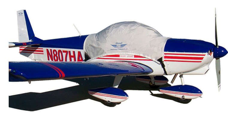
Alarus Canopy Cover

This cover type is made from Silver Acrylic Sunbrella canvas and is 100% lined with a soft and smooth microfiber. Bruce's Custom Covers developed this material combination especially for aircraft protection. The outer material is medium weight and treated for water resistance, UV resistance and anti-static buildup. The inner lining is a very soft and smooth microfiber to prevent scratching. The material is very reflective, and tests show that the cabin interior temperature can be reduced to near-ambient temperature on the hottest of days. It is water, ice and snow repellent, yet breathable to allow moisture to escape from between the cover and the aircraft surface.