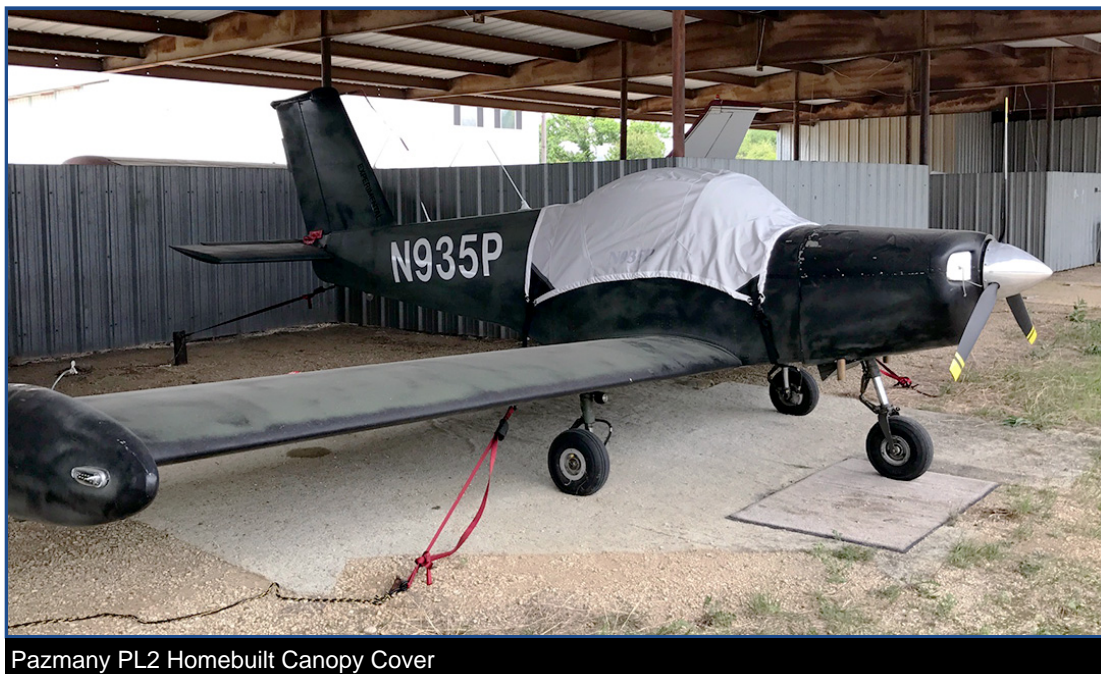
Pazmany PL2 Homebuilt Canopy Cover