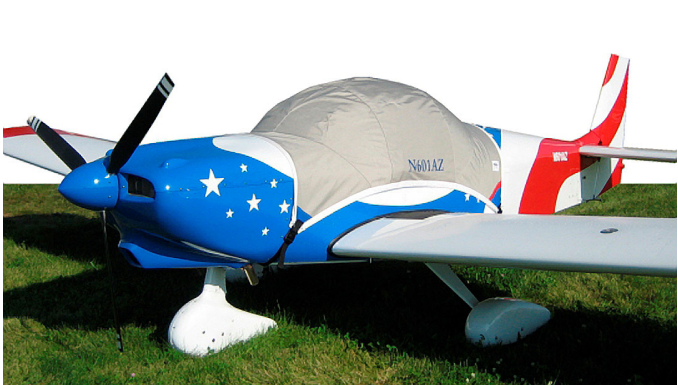
Zenith CH601 Canopy Cover