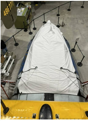
Consolidated Vultee PBY Cockpit/Nose Cover