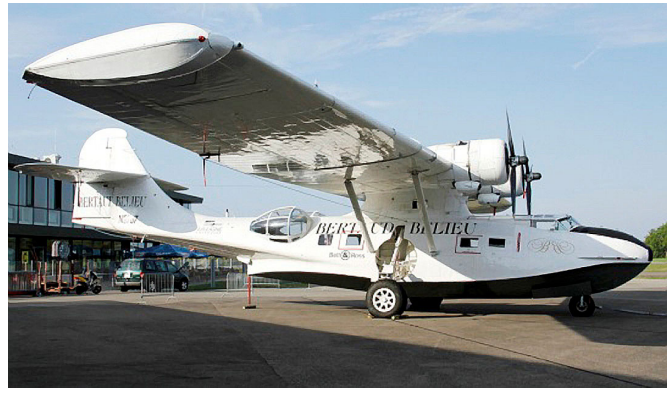
Covers, Plugs, and related items for the PBY