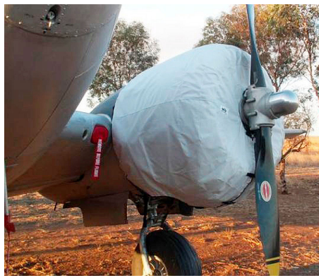
Beech D-18 Engine Covers, Center Section Oil Cooler Inlet Plugs, and Pitot Covers