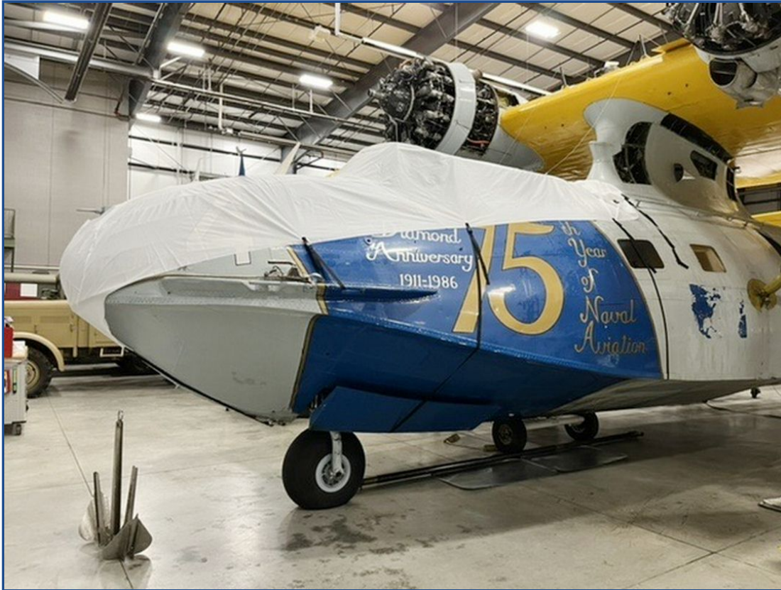
Vultee PBY Amphibian Cockpit/Nose Cover