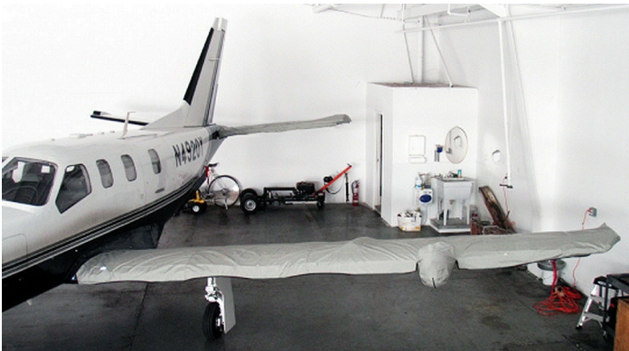
Pilatus PC-12 Wing Covers