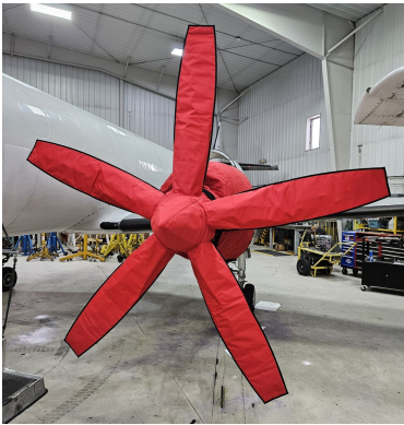
Fairchild Metro 5 Blade Insulated Insulated Prop Covers