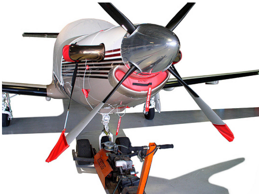
Pilatus PC-12 LARGE ENGINE INLET PLUG, SMALL PLUGS SET, Prop Tie/Exhaust Covers

This cover type is made from Silver Acrylic Sunbrella canvas and is 100% lined with a soft and smooth microfiber. Bruce's Custom Covers developed this material combination especially for aircraft protection. The outer material is medium weight and treated for water resistance, UV resistance and anti-static buildup. The inner lining is a very soft and smooth microfiber to prevent scratching. The material is very reflective, and tests show that the cabin interior temperature can be reduced to near-ambient temperature on the hottest of days. It is water, ice and snow repellent, yet breathable to allow moisture to escape from between the cover and the aircraft surface.