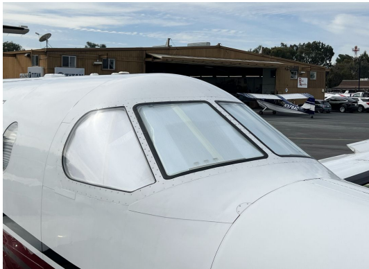
Pilatus PC-12 Cockpit HeatShields