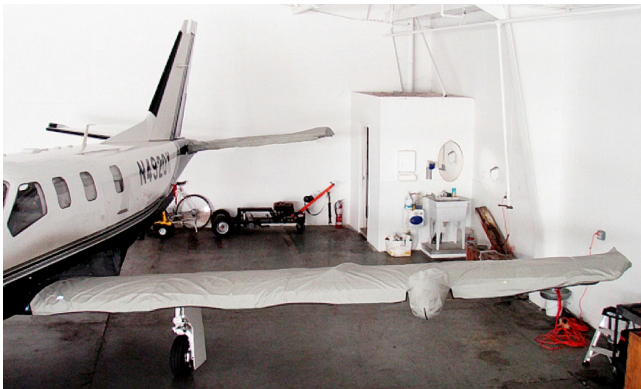
Socata TBM 700, 850 Wing and Horizontal Stabilizer Covers

WINTER USE MATERIAL - Made with Solution-Dyed Polyester fabric, this option is intended for seasonal use to aid in deicing, rain mitigation, or for occasional travel. The material is lighter and more compact, but more susceptible to UV damage and may have a shorter useful life if used continuously outside than the all-year use material.