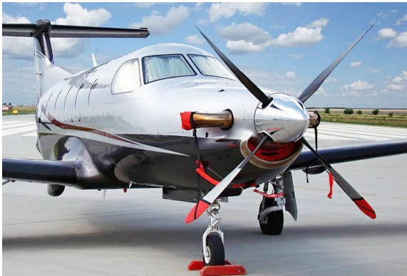
Pilatus PC-12 Engine Plugs, Prop Ties, Cockpit HeatShields

Cockpit Heatshields are interior sunshades for the aircraft's cockpit. The product is a unique composite of closed-cell foam with a silver mylar finish. The semi-rigid design is stiff enough to stand inside the window framing. The set folds up flat and is easily stored in the included storage sleeve. Some designs may require velcro and suction cups. A Heatshield is an excellent short-term remedy for cockpit overheating, but an external fabric cover is more effective for long-term protection.