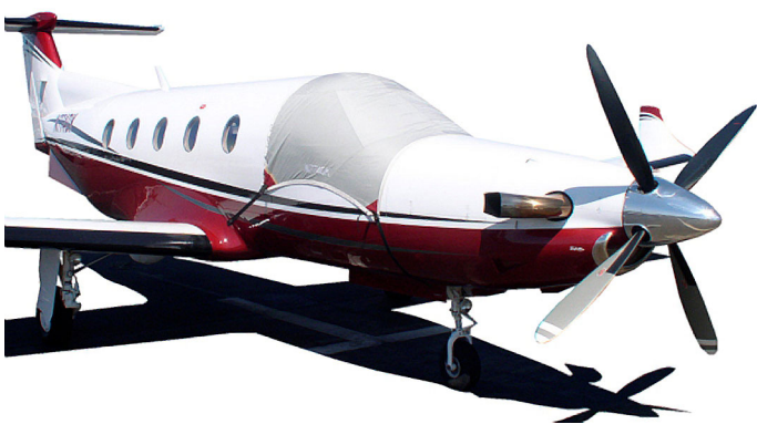
PC-12 Canopy Cover, Engine Plugs, Prop Tie/Exhaust Covers