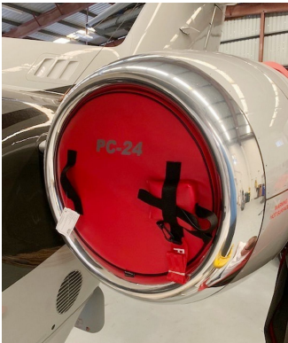
Pilatus PC-24 Engine Intake Plug

The Engine Inlet Plugs are custom fit for your Pilatus PC-24 intakes, made with heavy-duty vinyl material, and stuffed with a single block of sculpted urethane foam. Each plug has a zipper that allows the foam to be removed and dried if necessary. Engine plugs have 'remove before flight' streamers sewn onto the face of the plugs. Most plugs are imprinted with the aircraft registration number in black for an extra charge. Storage bag NOT included. Engine plugs may be inserted after flight when the engine is still warm. Engine Inlet Plugs are commonly referred to as Cowl Plugs, Intake Plugs, Cowl Blocks, Engine Blocks, and Engine Bungs.