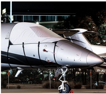
Pilatus PC-24 Cockpit Cover