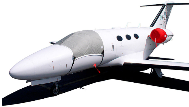
Citation Mustang Windshield Cover, Intake Cover/Exhaust Plug Set, Pitot Covers