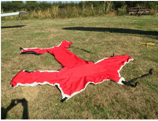
Porterfield Collegiate Canopy Cover