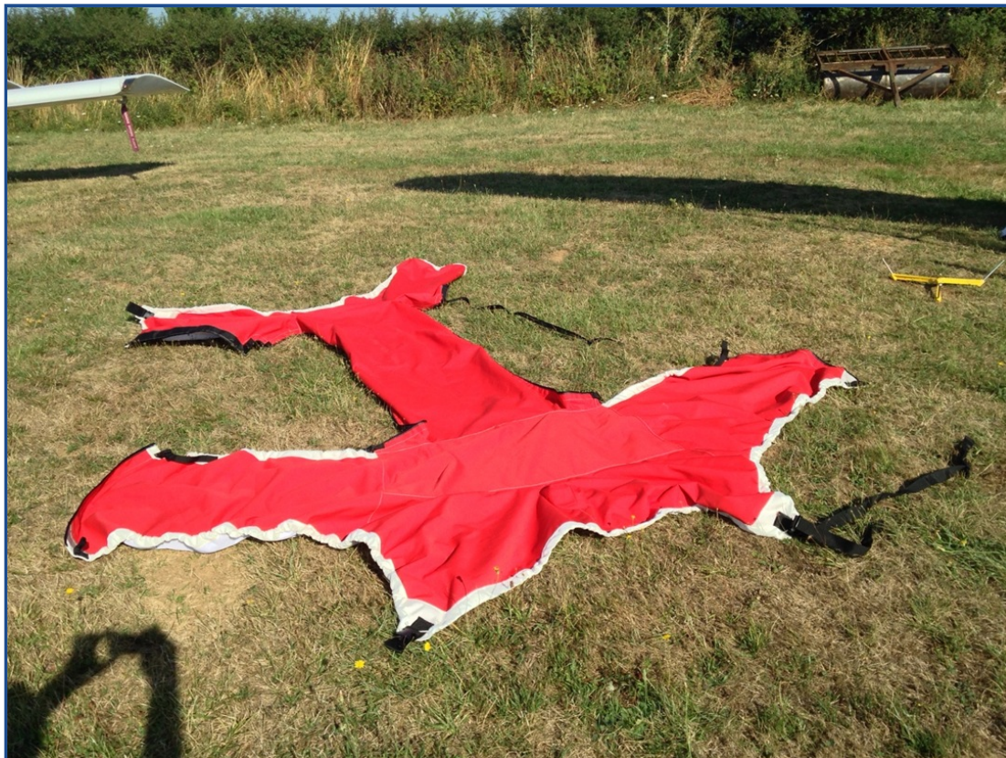
Porterfield Collegiate Canopy Cover