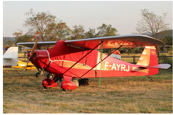
Porterfield Collegiate Canopy Cover