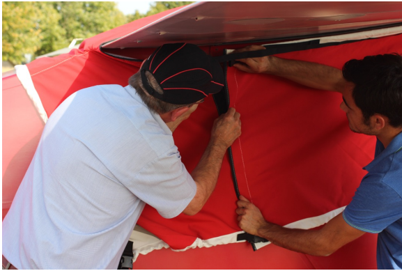
Porterfield Collegiate Canopy Cover

water resistance, UV resistance and anti-static buildup. The inner lining is a very soft and smooth microfiber to prevent scratching. The material is very reflective, and tests show that the cabin interior temperature can be reduced to near-ambient temperature on the hottest of days. It is water, ice and snow repellent, yet breathable to allow moisture to escape from between the cover and the aircraft surface.