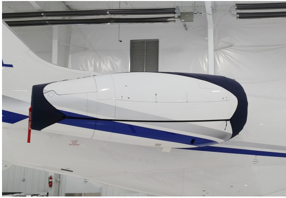
Challenger 300 Intake/Exhaust Cover Set, 3-strap type

imprinted with the aircraft registration number in black. Engine plugs may be inserted after flight when the engine is still warm. Engine Inlet Plugs are commonly referred to as Cowl Plugs, Intake Plugs, Cowl Blocks, Engine Blocks, and Engine Bungs.