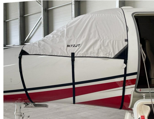
Hawker Premier Cockpit Cover