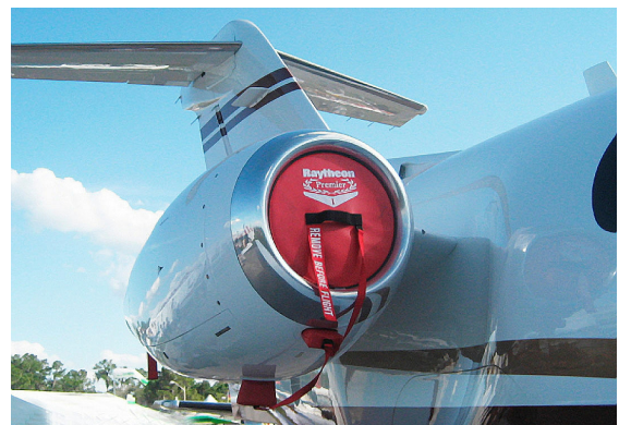
Hawker Beechcraft Premier 390 Intake Plug/Exhaust Plug Set Premier Intake/Exhaust Plug set with Generator Inlet/Exhaust Plugs