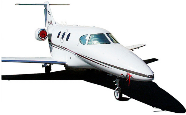
Raytheon Premier Intake Plugs, Pitot Covers & Cockpit HeatShields