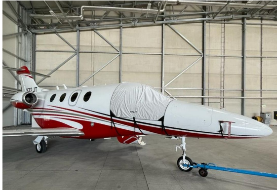
Hawker Premier Cockpit Cover

This cover type is made from Silver Acrylic Sunbrella canvas and is 100% lined with a soft and smooth microfiber. Bruce's Custom Covers developed this material combination especially for aircraft protection. The outer material is medium weight and treated for water resistance, UV resistance and anti-static buildup. The inner lining is a very soft and smooth microfiber to prevent scratching. The material is very reflective, and tests show that the cabin interior temperature can be reduced to near-ambient temperature on the hottest of days. It is water, ice and snow repellent, yet breathable to allow moisture to escape from between the cover and the aircraft surface.