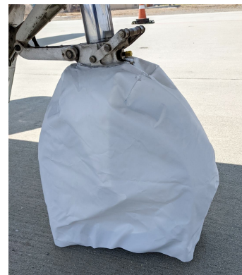
CJ1 Nose Gear Tire Cover, test fit