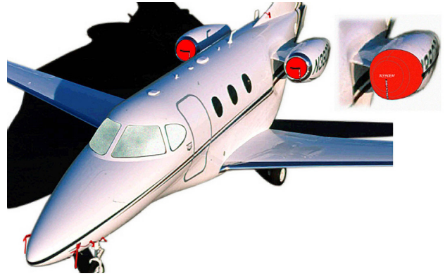
Premier Intake Plugs, Intake Covers, Pitot Covers & Cockpit HeatShields