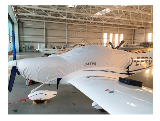
SportCruiser Canopy/Engine Cover

This cover type is made from Silver Acrylic Sunbrella canvas and is 100% lined with a soft and smooth microfiber. Bruce's Custom Covers developed this material combination especially for aircraft protection. The outer material is medium weight and treated for water resistance, UV resistance and anti-static buildup. The inner lining is a very soft and smooth microfiber to prevent scratching. The material is very reflective, and tests show that the cabin interior temperature can be reduced to near-ambient temperature on the hottest of days. It is water, ice and snow repellent, yet breathable to allow moisture to escape from between the cover and the aircraft surface.