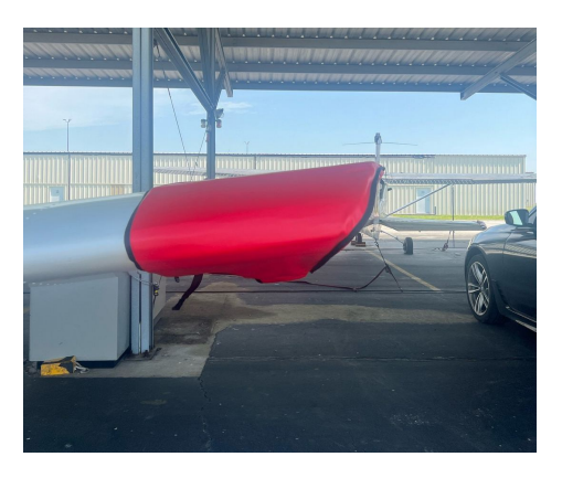
Piper PA-28-140 Wingtip Pads

Designed to prevent damage to the aircraft extremities in crowded hangars, these products are made of bright red Naugahyde and thickly padded with a sandwich of closed cell foam.