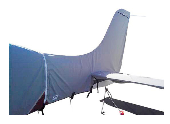
Cirrus SR20 Empennage Cover (covers tail boom, vertical and horizontal stabilizers)