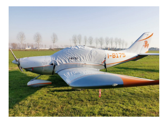
CZAW Sportcruiser Canopy Cover