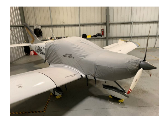
Czech Sport Travel Light Weight Canopy/Engine Cover, Wing Locker Covers

WINTER USE MATERIAL - Made with Solution-Dyed Polyester fabric, this option is intended for seasonal use to aid in deicing, rain mitigation, or for occasional travel. The material is lighter and more compact, but more susceptible to UV damage and may have a shorter useful life if used continuously outside than the all-year use material.