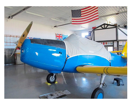
Fairchild PT-26 Canopy Cover