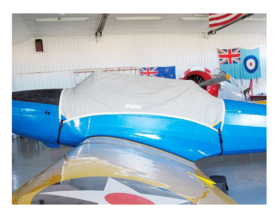
Fairchild PT-26 Canopy Cover

Travel Covers are made with Silver Solution-Dyed Polyester fabric and only lined over the windshield to save weight. The material is lightweight and more compact for easy stowage in the aircraft. The polyester material is water resistant, but only intended for occasional use outside. We also have an ultra lightweight material available for fitted hangar dust covers. For daily outdoor use, the non-travel Sunbrella Cover is the best choice.