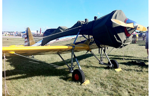
Ryan PT-22 Canopy Cover and Engine Cover