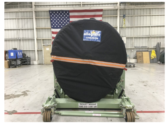
CFM56-5B Off Link Cover, fully enclosed