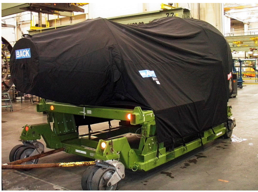
PW 2000 Series OFF-LINK ENGINE STORAGE COVER, Rain Cap