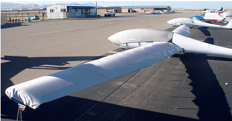
PZL Swidnik PW-5 Canopy/Nose, Wing & Empennage Covers, 3D model Grob 103 Canopy/Nose Cover and Wing Covers