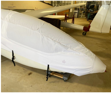
PZL Swidnik PW6 Canopy/Nose Cover