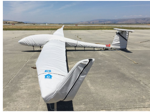
Schemp-Hirth Discus 2B Full Cover Set