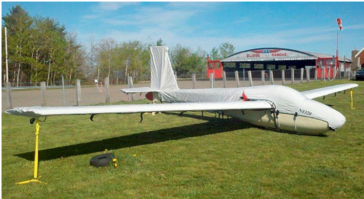
Schweizer 1-26B Canopy/Nose, Empennage & Wing Covers

Covers developed this material combination especially for aircraft protection. The outer material is medium weight and treated for water resistance, UV resistance and anti-static buildup. The inner lining is a very soft and smooth microfiber to prevent scratching. The material is very reflective, and tests show that the cabin interior temperature can be reduced to near-ambient temperature on the hottest of days. It is water, ice and snow repellent, yet breathable to allow moisture to escape from between the cover and the aircraft surface.