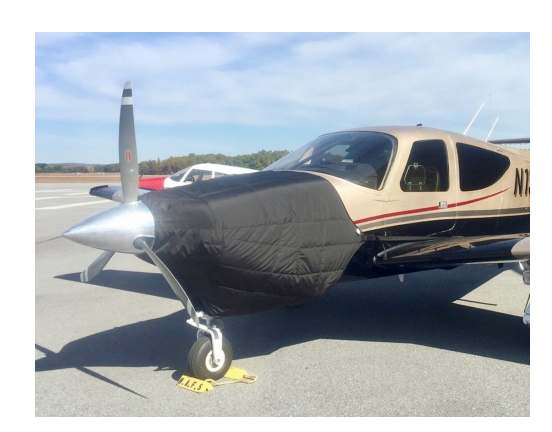
Rockwell Aero Commander Insulated Engine Cover

This cover type is made from Silver Acrylic Sunbrella canvas and is 100% lined with a soft and smooth microfiber. Bruce's Custom Covers developed this material combination especially for aircraft protection. The outer material is medium weight and treated for water resistance, UV resistance and anti-static buildup. The inner lining is a very soft and smooth microfiber to prevent scratching. The material is very reflective, and tests show that the cabin interior temperature can be reduced to near-ambient temperature on the hottest of days. It is water, ice and snow repellent, yet breathable to allow moisture to escape from between the cover and the aircraft surface.