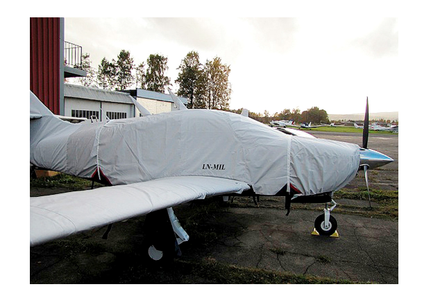
Rockwell Commander 114 Full Cover Set