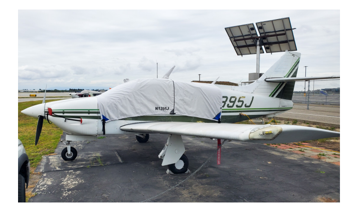
Rockwell International 112A Canopy Cover