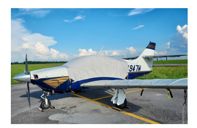
Rockwell 114 Canopy Cover & Wing Covers

This cover type is made from Silver Acrylic Sunbrella canvas and is 100% lined with a soft and smooth microfiber. Bruce's Custom Covers developed this material combination especially for aircraft protection. The outer material is medium weight and treated for water resistance, UV resistance and anti-static buildup. The inner lining is a very soft and smooth microfiber to prevent scratching. The material is very reflective, and tests show that the cabin interior temperature can be reduced to near-ambient temperature on the hottest of days. It is water, ice and snow repellent, yet breathable to allow moisture to escape from between the cover and the aircraft surface.