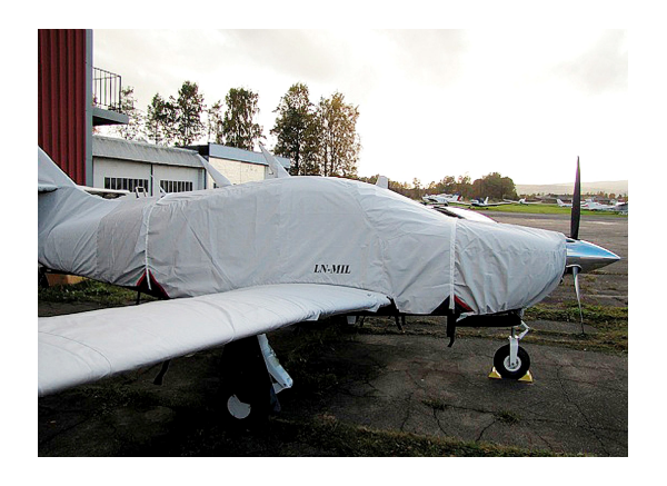
Rockwell Commander Engine, Extended Canopy, Wings, & Empennage Covers