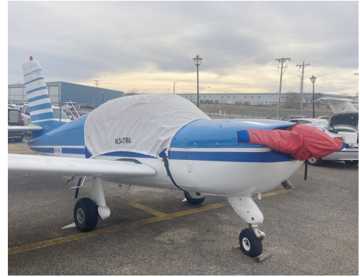
SOCATA Rallye 150 Canopy Cover, Prop Cover