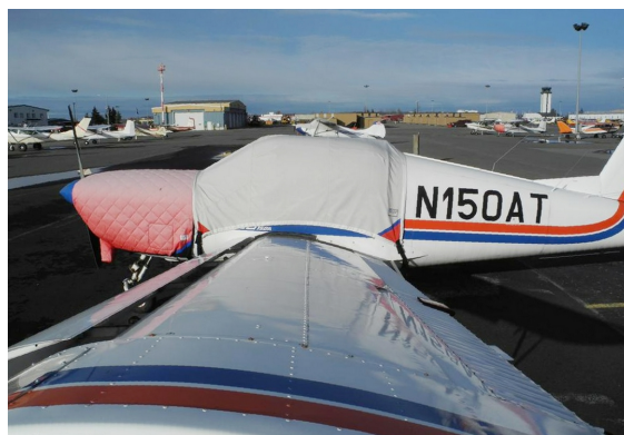
Koliber 150A Canopy Cover, Insulated Engine Cover