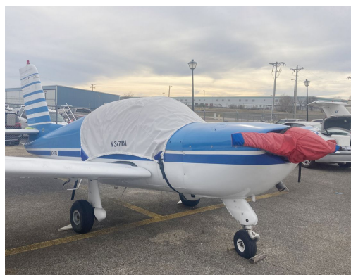
SOCATA Rallye 150 Canopy Cover, Prop Cover

This cover type is made from Silver Acrylic Sunbrella canvas and is 100% lined with a soft and smooth microfiber. Bruce's Custom Covers developed this material combination especially for aircraft protection. The outer material is medium weight and treated for water resistance, UV resistance and anti-static buildup. The inner lining is a very soft and smooth microfiber to prevent scratching. The material is very reflective, and tests show that the cabin interior temperature can be reduced to near-ambient temperature on the hottest of days. It is water, ice and snow repellent, yet breathable to allow moisture to escape from between the cover and the aircraft surface.