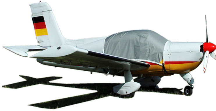
Rallye 150 Canopy Cover

The Aerospatiale (Socata) Rallye 150 Canopy/Engine Cover is a one-piece cover (100% lined with microfiber) that is a combination of the Canopy Cover and Engine Cover. This cover will enclose the engine cowl and will extend aft to cover all of the windows. This cover type is made from Silver Acrylic Sunbrella canvas and is 100% lined with a soft and smooth microfiber. Bruce's Custom Covers developed this material combination especially for aircraft protection. The outer material is medium weight and treated for water resistance, UV resistance and anti-static buildup. The inner lining is a very soft and smooth microfiber to prevent scratching. The material is very reflective, and tests show that the cabin interior temperature can be reduced to near-ambient temperature on the hottest of days. It is water, ice and snow repellent, yet breathable to allow moisture to escape from between the cover and the aircraft surface.