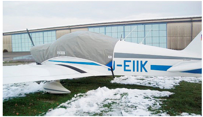
Robin R.2160 Canopy/Engine Cover