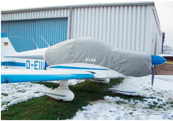
Robin R.2160 Canopy/Engine Cover