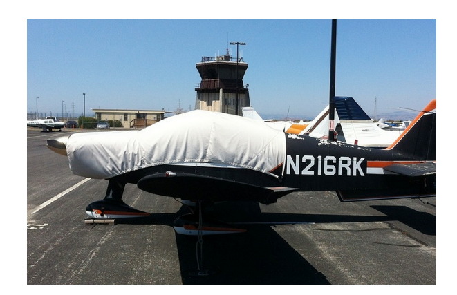
Robin Canopy/Engine Cover

This cover type is made from Silver Acrylic Sunbrella canvas and is 100% lined with a soft and smooth microfiber. Bruce's Custom Covers developed this material combination especially for aircraft protection. The outer material is medium weight and treated for water resistance, UV resistance and anti-static buildup. The inner lining is a very soft and smooth microfiber to prevent scratching. The material is very reflective, and tests show that the cabin interior temperature can be reduced to near-ambient temperature on the hottest of days. It is water, ice and snow repellent, yet breathable to allow moisture to escape from between the cover and the aircraft surface.