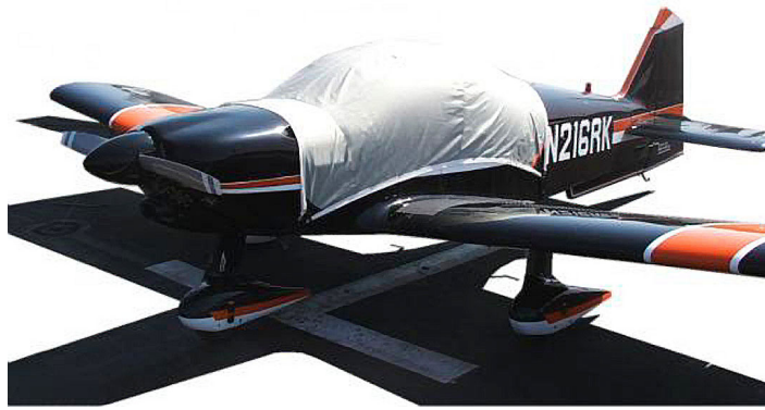
Robin R.2160 Canopy Cover