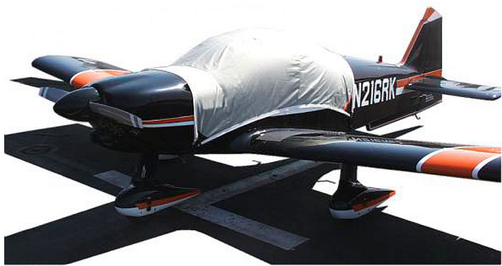
Robin R.2160 Canopy Cover

the hottest of days. It is water, ice and snow repellent, yet breathable to allow moisture to escape from between the cover and the aircraft surface.