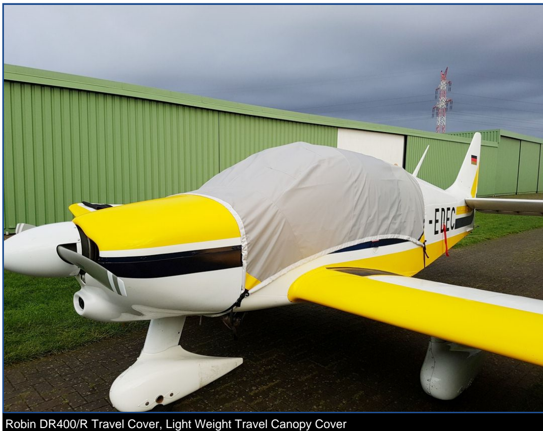
Robin DR400/R Travel Cover, Light Weight Travel Canopy Cover