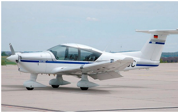
Canopy Cover for the Robin 3140 & R-3000