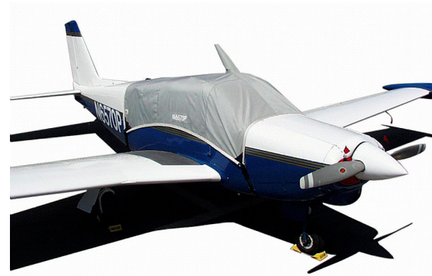
Piper Comanche Standard Canopy Cover & Engine Plugs