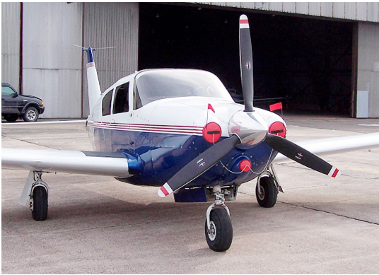
Piper Comanche Engine Plugs

Engine Inlet Plugs are custom fit for your Ravin 300 & 500 Models intakes, made with heavy-duty vinyl material, and stuffed with a single block of sculpted urethane foam. Each plug has a zipper that allows the foam to be removed and dried if necessary. Engine plugs have warning flags that are visible from the cockpit or 'remove before flight' streamers sewn onto the face of the plugs. Most plugs are imprinted with the aircraft registration number in black for an extra charge. Storage bag NOT included. Engine plugs may be inserted after flight when the engine is still warm. Engine Inlet Plugs are commonly referred to as Cowl Plugs, Intake Plugs, Cowl Blocks, Engine Blocks, and Engine Bungs.