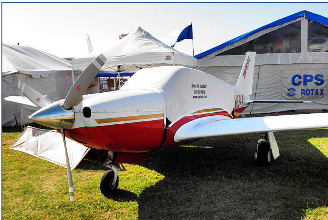
Ravin 500 Standard Canopy Cover