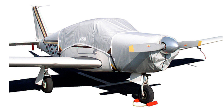
Piper Comanche Canopy & Engine Covers

This cover type is made from Silver Acrylic Sunbrella canvas and is 100% lined with a soft and smooth microfiber. Bruce's Custom Covers developed this material combination especially for aircraft protection. The outer material is medium weight and treated for water resistance, UV resistance and anti-static buildup. The inner lining is a very soft and smooth microfiber to prevent scratching. The material is very reflective, and tests show that the cabin interior temperature can be reduced to near-ambient temperature on the hottest of days. It is water, ice and snow repellent, yet breathable to allow moisture to escape from between the cover and the aircraft surface.