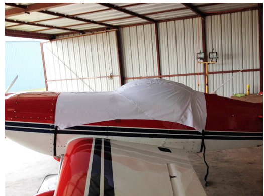
IAC One Design Canopy Cover, test fit cover