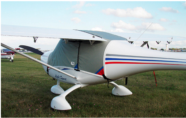
Remos G3 Travel Weight Canopy Cover

This cover type is made from Silver Acrylic Sunbrella canvas and is 100% lined with a soft and smooth microfiber. Bruce's Custom Covers developed this material combination especially for aircraft protection. The outer material is medium weight and treated for water resistance, UV resistance and anti-static buildup. The inner lining is a very soft and smooth microfiber to prevent scratching. The material is very reflective, and tests show that the cabin interior temperature can be reduced to near-ambient temperature on the hottest of days. It is water, ice and snow repellent, yet breathable to allow moisture to escape from between the cover and the aircraft surface.