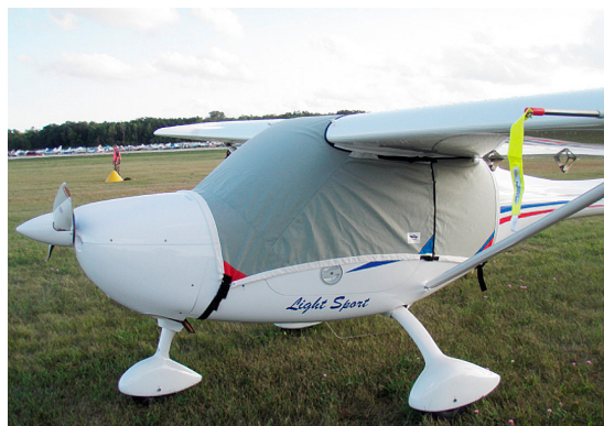
Remos G3 Travel Weight Canopy Cover