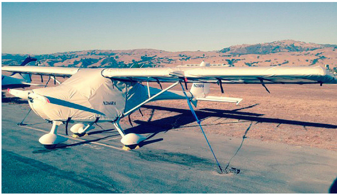
Remos Extended Canopy/Engine, Wing Covers