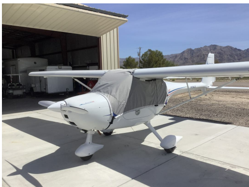
Remos G-3/600 Travel Cover

Travel Covers are made with Silver Solution-Dyed Polyester fabric and only lined over the windshield to save weight. The material is lightweight and more compact for easy stowage in the aircraft. The polyester material is water resistant, but only intended for occasional use outside. We also have an ultra lightweight material available for fitted hangar dust covers. For daily outdoor use, the non-travel Sunbrella Cover is the best choice.