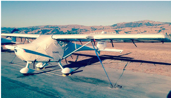
Remos Extended Canopy/Engine, Wing Covers