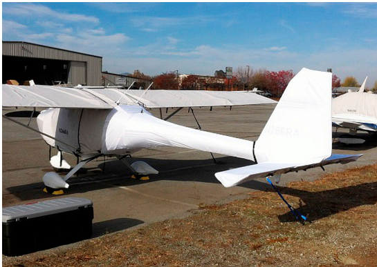
Remos Empennage Cover (test fit cover)

WINTER USE MATERIAL - Made with Solution-Dyed Polyester fabric, this option is intended for seasonal use to aid in deicing, rain mitigation, or for occasional travel. The material is lighter and more compact, but more susceptible to UV damage and may have a shorter useful life if used continuously outside than the all-year use material.