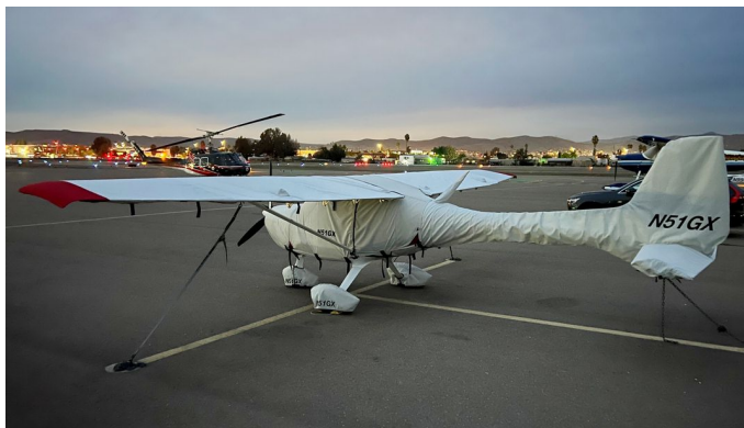
Remos RG-3 Complete Cover Set