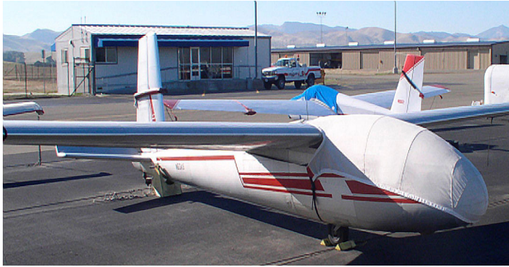
Blanik L13 Canopy/Nose Cover