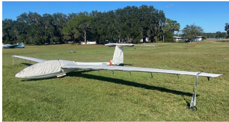
Rolladen-Schneider LS-4 Wing Covers

WINTER USE MATERIAL - Made with Solution-Dyed Polyester fabric, this option is intended for seasonal use to aid in deicing, rain mitigation, or for occasional travel. The material is lighter and more compact, but more susceptible to UV damage and may have a shorter useful life if used continuously outside than the all-year use material.