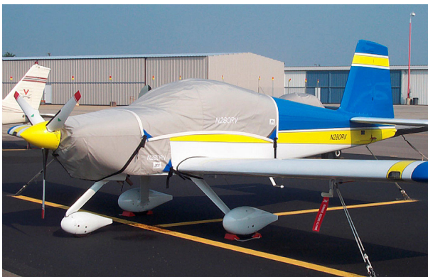
Van's RV-9 Canopy & Engine Covers

This cover type is made from Silver Acrylic Sunbrella canvas and is 100% lined with a soft and smooth microfiber. Bruce's Custom Covers developed this material combination especially for aircraft protection. The outer material is medium weight and treated for water resistance, UV resistance and anti-static buildup. The inner lining is a very soft and smooth microfiber to prevent scratching. The material is very reflective, and tests show that the cabin interior temperature can be reduced to near-ambient temperature on the hottest of days. It is water, ice and snow repellent, yet breathable to allow moisture to escape from between the cover and the aircraft surface.