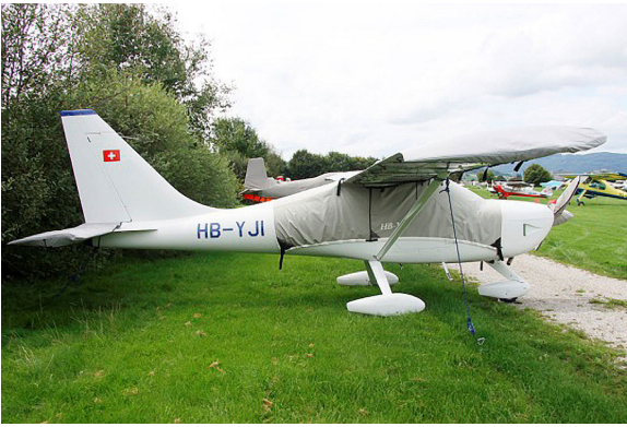
Glaster Canopy, Wings, Horizontal Stab. & Prop Covers