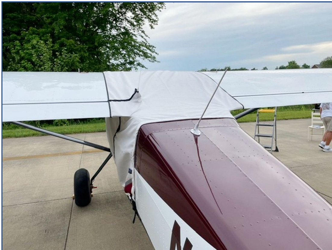
Rans S-21 Outbound Canopy Cover