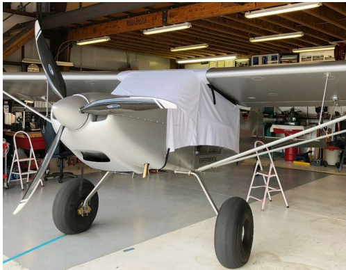
Rans S-20 Canopy Cover, test fit cover