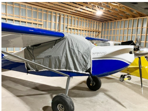
Rans S-21 Travel Weight Canopy Cover

Travel Covers are made with Silver Solution-Dyed Polyester fabric and only lined over the windshield to save weight. The material is lightweight and more compact for easy stowage in the aircraft. The polyester material is water resistant, but only intended for occasional use outside. We also have an ultra lightweight material available for fitted hangar dust covers. For daily outdoor use, the non-travel Sunbrella Cover is the best choice.