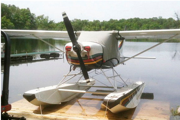
Glastar Sportsman Canopy Cover and Engine Plugs

Engine Inlet Plugs are custom fit for your Rans S-21 Outbound intakes, made with heavy-duty vinyl material, and stuffed with a single block of sculpted urethane foam. Each plug has a zipper that allows the foam to be removed and dried if necessary. Engine plugs have warning flags that are visible from the cockpit or 'remove before flight' streamers sewn onto the face of the plugs. Most plugs are imprinted with the aircraft registration number in black for an extra charge. Storage bag NOT included. Engine plugs may be inserted after flight when the engine is still warm. Engine Inlet Plugs are commonly referred to as Cowl Plugs, Intake Plugs, Cowl Blocks, Engine Blocks, and Engine Bungs.