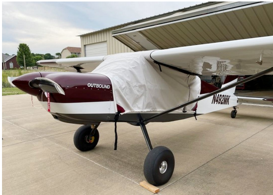
Rans S-21 Outbound Canopy Cover