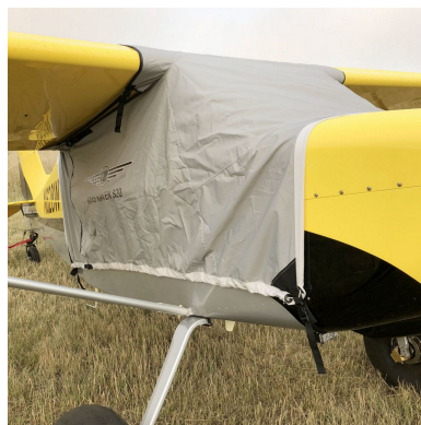
Rans S-20 Raven Travel Cover, Light Weight Travel Canopy Cover