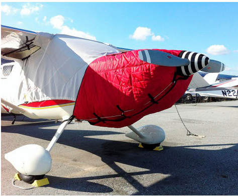
Glastar Insulated Engine Cover