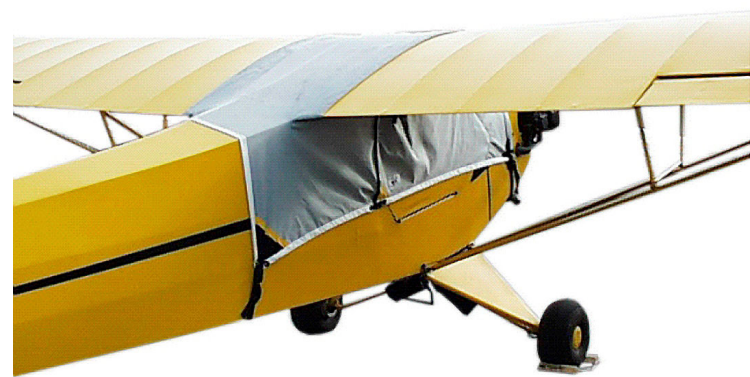
Piper J3 Over-Top Canopy Cover

This cover type is made from Silver Acrylic Sunbrella canvas and is 100% lined with a soft and smooth microfiber. Bruce's Custom Covers developed this material combination especially for aircraft protection. The outer material is medium weight and treated for water resistance, UV resistance and anti-static buildup. The inner lining is a very soft and smooth microfiber to prevent scratching. The material is very reflective, and tests show that the cabin interior temperature can be reduced to near-ambient temperature on the hottest of days. It is water, ice and snow repellent, yet breathable to allow moisture to escape from between the cover and the aircraft surface.