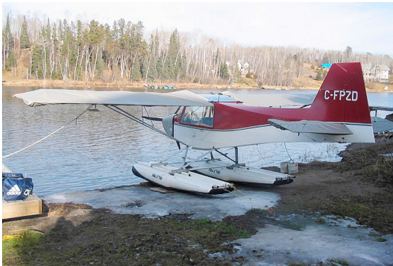
Rans S-7 Insulated Engine Cover, Wing Covers and Horizontal Stabilizer Covers

WINTER USE MATERIAL - Made with Solution-Dyed Polyester fabric, this option is intended for seasonal use to aid in deicing, rain mitigation, or for occasional travel. The material is lighter and more compact, but more susceptible to UV damage and may have a shorter useful life if used continuously outside than the all-year use material.