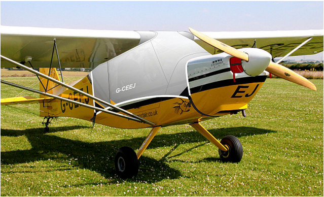
Rans Canopy Cover & Engine Plugs (illustration on a Rans S-7)