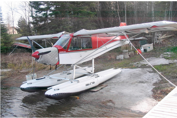
FOR INTERIOR USE. Cub Crafters CC-11 Insulated Hangar Blanket, Rans S-7 Insulated Engine, Wing and Horizontal Stabilizer Covers