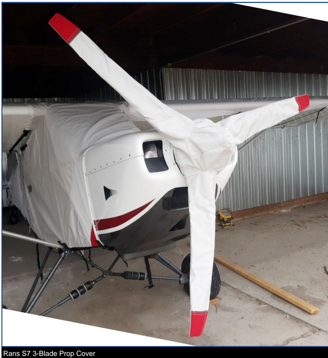
Rans S7 3-Blade Prop Cover