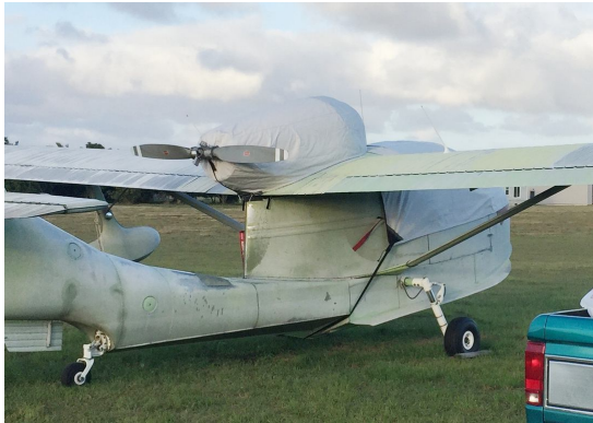
Republic Seabee Amphibian Engine Cover

water resistance, UV resistance and anti-static buildup. The inner lining is a very soft and smooth microfiber to prevent scratching. The material is very reflective, and tests show that the cabin interior temperature can be reduced to near-ambient temperature on the hottest of days. It is water, ice and snow repellent, yet breathable to allow moisture to escape from between the cover and the aircraft surface.