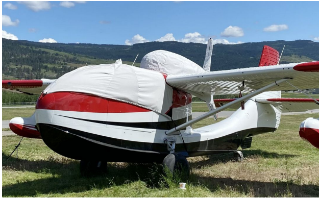
Republic Seabee Canopy, Engine, Prop Cover (5-blade)