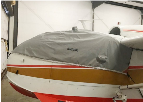
Republic Seabee Canopy Cover

The material is very reflective, and tests show that the cabin interior temperature can be reduced to near-ambient temperature on the hottest of days. It is water, ice and snow repellent, yet breathable to allow moisture to escape from between the cover and the aircraft surface.