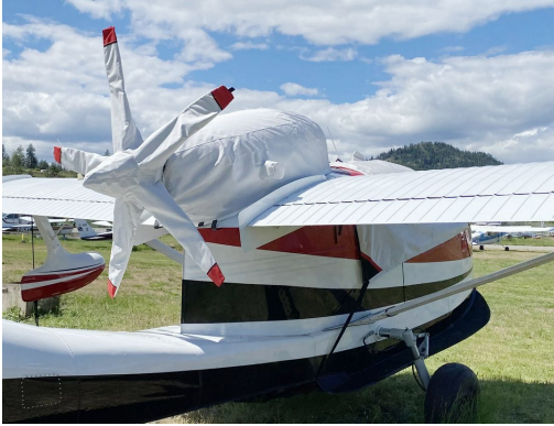
Republic Seabee Canopy, Engine, Prop Cover (5-blade)

water resistance, UV resistance and anti-static buildup. The inner lining is a very soft and smooth microfiber to prevent scratching. The material is very reflective, and tests show that the cabin interior temperature can be reduced to near-ambient temperature on the hottest of days. It is water, ice and snow repellent, yet breathable to allow moisture to escape from between the cover and the aircraft surface.