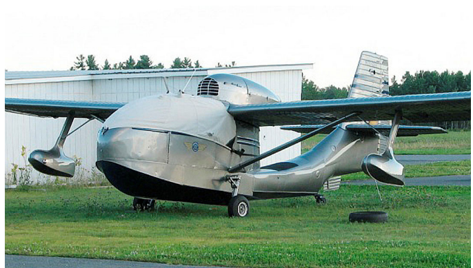
Seabee Canopy Cover