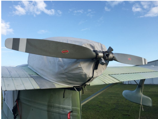
Republic Seabee Engine Cover