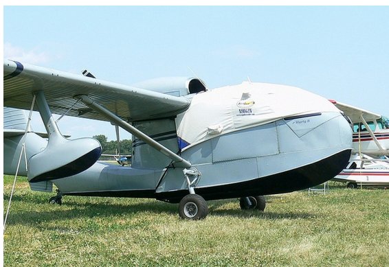
Republic Seabee Canopy Cover

This cover type is made from Silver Acrylic Sunbrella canvas and is 100% lined with a soft and smooth microfiber. Bruce's Custom Covers developed this material combination especially for aircraft protection. The outer material is medium weight and treated for water resistance, UV resistance and anti-static buildup. The inner lining is a very soft and smooth microfiber to prevent scratching. The material is very reflective, and tests show that the cabin interior temperature can be reduced to near-ambient temperature on the hottest of days. It is water, ice and snow repellent, yet breathable to allow moisture to escape from between the cover and the aircraft surface.