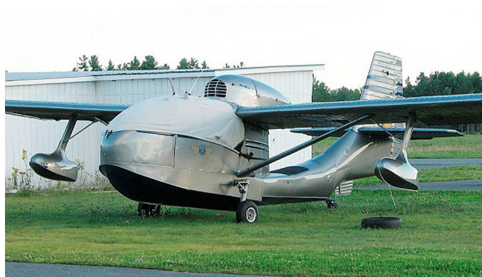
Seabee Canopy Cover