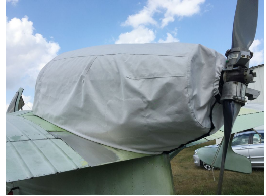
Republic Seabee Engine Cover