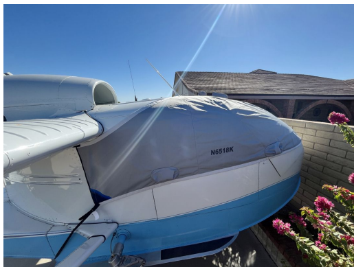
Seabee Amphibian Travel Cover, Light Weight Canopy Cover

This cover type is made from Silver Acrylic Sunbrella canvas and is 100% lined with a soft and smooth microfiber. Bruce's Custom Covers developed this material combination especially for aircraft protection. The outer material is medium weight and treated for water resistance, UV resistance and anti-static buildup. The inner lining is a very soft and smooth microfiber to prevent scratching. The material is very reflective, and tests show that the cabin interior temperature can be reduced to near-ambient temperature on the hottest of days. It is water, ice and snow repellent, yet breathable to allow moisture to escape from between the cover and the aircraft surface.