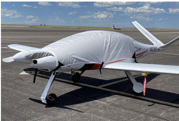
Swiss Excellence Risen 914 Canopy Cover

This cover type is made from Silver Acrylic Sunbrella canvas and is 100% lined with a soft and smooth microfiber. Bruce's Custom Covers developed this material combination especially for aircraft protection. The outer material is medium weight and treated for water resistance, UV resistance and anti-static buildup. The inner lining is a very soft and smooth microfiber to prevent scratching. The material is very reflective, and tests show that the cabin interior temperature can be reduced to near-ambient temperature on the hottest of days. It is water, ice and snow repellent, yet breathable to allow moisture to escape from between the cover and the aircraft surface.