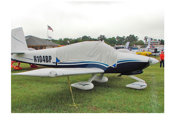
Van's RV-10 Canopy Cover