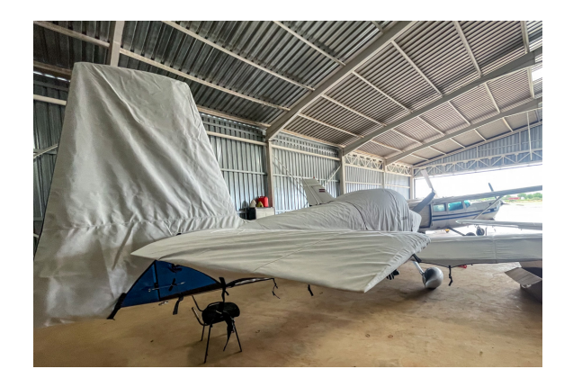
Van's RV-10 Full Cover Set