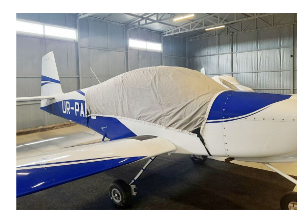
Van's RV-10 Travel Weight Canopy Cover

Travel Covers are made with Silver Solution-Dyed Polyester fabric and only lined over the windshield to save weight. The material is lightweight and more compact for easy stowage in the aircraft. The polyester material is water resistant, but only intended for occasional use outside. We also have an ultra lightweight material available for fitted hangar dust covers. For daily outdoor use, the non-travel Sunbrella Cover is the best choice.