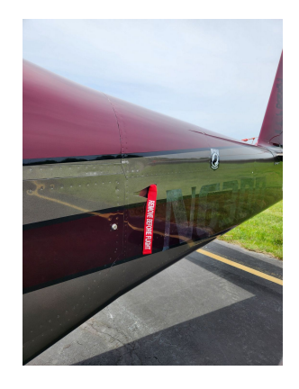
RV-10 Air Vent Wedge Plugs

Engine Inlet Plugs are custom fit for your Van's Aircraft RV-10 intakes, made with heavy-duty vinyl material, and stuffed with a single block of sculpted urethane foam. Each plug has a zipper that allows the foam to be removed and dried if necessary. Engine plugs have warning flags that are visible from the cockpit or 'remove before flight' streamers sewn onto the face of the plugs. Most plugs are imprinted with the aircraft registration number in black for an extra charge. Storage bag NOT included. Engine plugs may be inserted after flight when the engine is still warm. Engine Inlet Plugs are commonly referred to as Cowl Plugs, Intake Plugs, Cowl Blocks, Engine Blocks, and Engine Bungs.