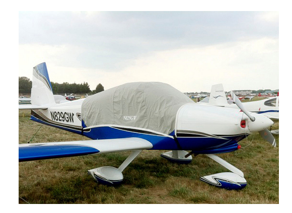
Van's RV-10 Canopy Cover & Engine Inlet Plugs

This cover type is made from Silver Acrylic Sunbrella canvas and is 100% lined with a soft and smooth microfiber. Bruce's Custom Covers developed this material combination especially for aircraft protection. The outer material is medium weight and treated for water resistance, UV resistance and anti-static buildup. The inner lining is a very soft and smooth microfiber to prevent scratching. The material is very reflective, and tests show that the cabin interior temperature can be reduced to near-ambient temperature on the hottest of days. It is water, ice and snow repellent, yet breathable to allow moisture to escape from between the cover and the aircraft surface.