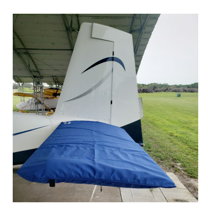
Van's RV-10 Horizontal Stabilizer Covers