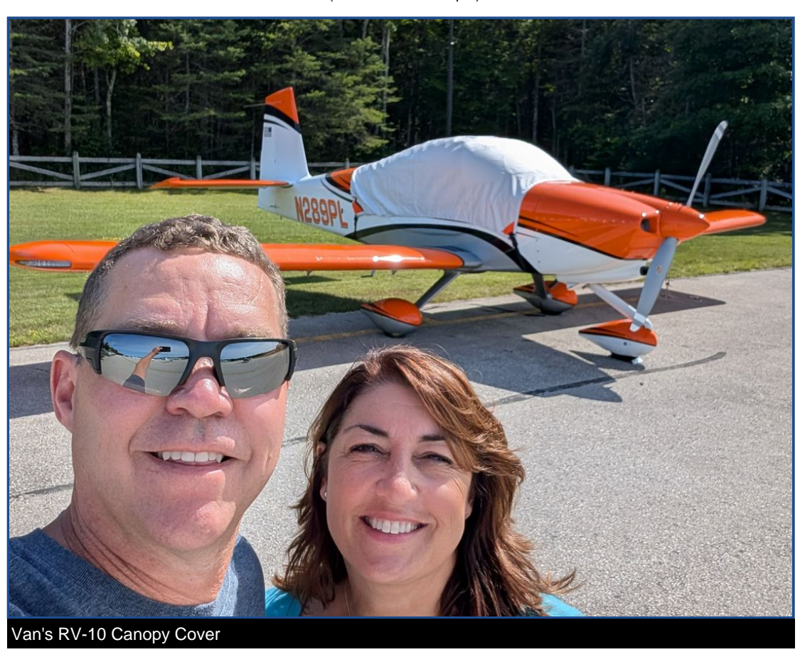
Section 1: Canopy/Cockpit/Fuselage Covers

Canopy Covers help reduce damage to your airplane's upholstery and avionics caused by excessive heat, and they can eliminate problems caused by leaking door and window seals. They keep the windshield and window surfaces clean and help prevent vandalism and theft.