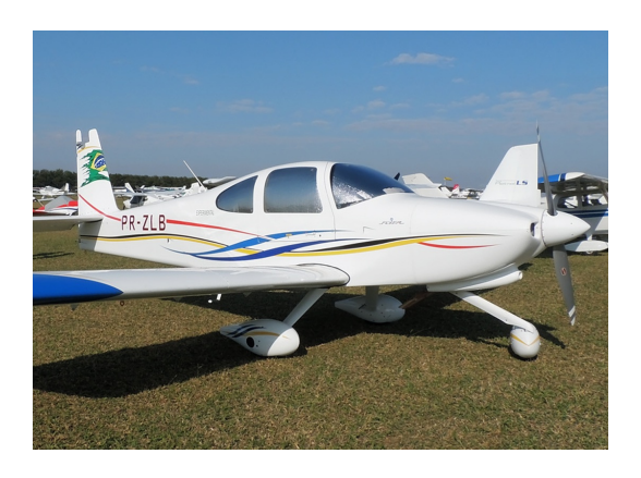
Van's RV-10 HeatShield Set