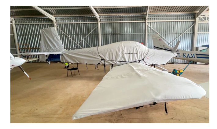
Van's RV-10 Full Cover Set

This cover type is made from Silver Acrylic Sunbrella canvas and is 100% lined with a soft and smooth microfiber. Bruce's Custom Covers developed this material combination especially for aircraft protection. The outer material is medium weight and treated for water resistance, UV resistance and anti-static buildup. The inner lining is a very soft and smooth microfiber to prevent scratching. The material is very reflective, and tests show that the cabin interior temperature can be reduced to near-ambient temperature on the hottest of days. It is water, ice and snow repellent, yet breathable to allow moisture to escape from between the cover and the aircraft surface.