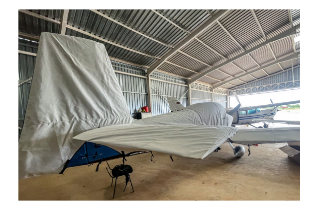
Van's RV-10 Full Cover Set