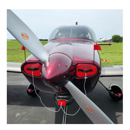
RV-10 Engine Inlet Plugs