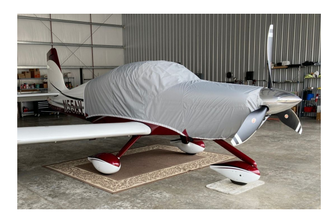
Van's RV-10 Travel Cover