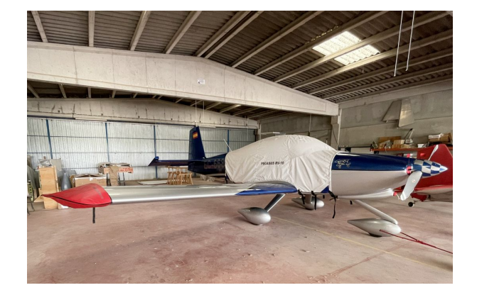
Van's RV-10 Extended Canopy Cover, Wingtip Pads