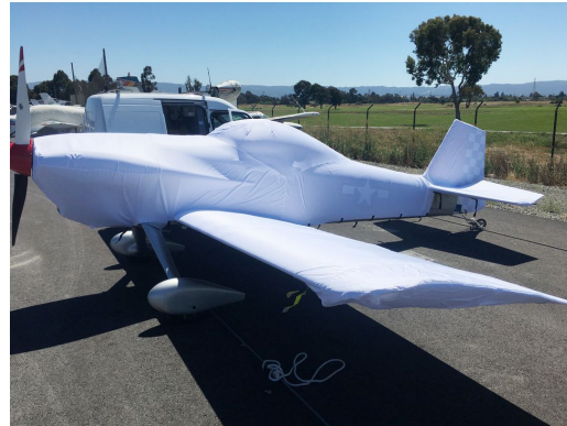
Van's RV-3 Complete Fuselage Cover with Detachable Wing Covers, test fit cover