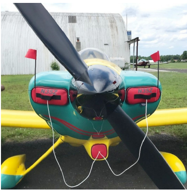
Van's Aircraft RV-4 Engine Inlet Plugs