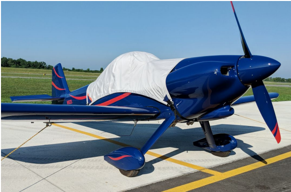
Van's RV-3 Canopy Cover

This cover type is made from Silver Acrylic Sunbrella canvas and is 100% lined with a soft and smooth microfiber. Bruce's Custom Covers developed this material combination especially for aircraft protection. The outer material is medium weight and treated for water resistance, UV resistance and anti-static buildup. The inner lining is a very soft and smooth microfiber to prevent scratching. The material is very reflective, and tests show that the cabin interior temperature can be reduced to near-ambient temperature on the hottest of days. It is water, ice and snow repellent, yet breathable to allow moisture to escape from between the cover and the aircraft surface.