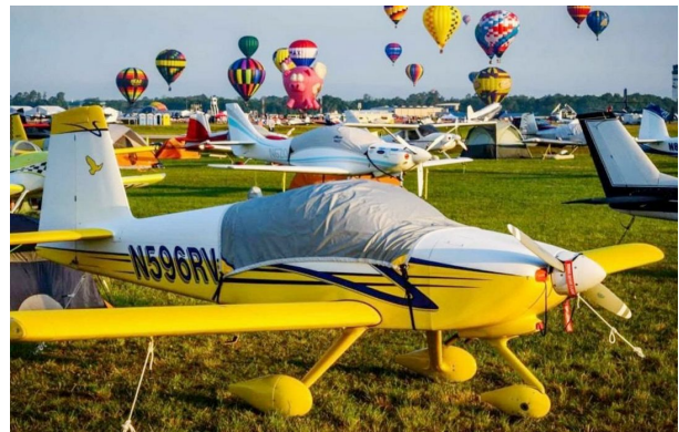
Vans's RV-9 Travel Weight Canopy Cover at Sun 'n Fun