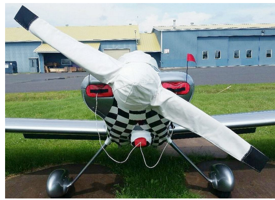
Van's RV-3 Engine Plugs, Prop/Spinner Cover