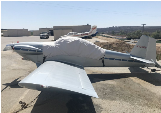
Van's RV-4 Canopy Cover

This cover type is made from Silver Acrylic Sunbrella canvas and is 100% lined with a soft and smooth microfiber. Bruce's Custom Covers developed this material combination especially for aircraft protection. The outer material is medium weight and treated for water resistance, UV resistance and anti-static buildup. The inner lining is a very soft and smooth microfiber to prevent scratching. The material is very reflective, and tests show that the cabin interior temperature can be reduced to near-ambient temperature on the hottest of days. It is water, ice and snow repellent, yet breathable to allow moisture to escape from between the cover and the aircraft surface.