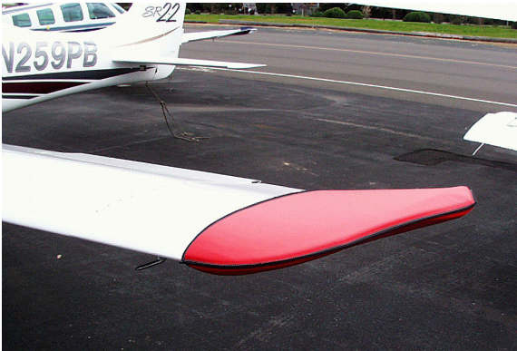
Cirrus SR-22 Wingtip Pad (also available for the Horiz. Stab.