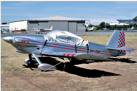
Vans's RV-4 Canopy Cover