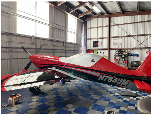
Gamebird GB-1 Solar Cap (single place), CUSTOM COVERS & IMPRINTING AVAILABLE!

Travel Covers are made with Silver Solution-Dyed Polyester fabric and only lined over the windshield to save weight. The material is lightweight and more compact for easy stowage in the aircraft. The polyester material is water resistant, but only intended for occasional use outside. We also have an ultra lightweight material available for fitted hangar dust covers. For daily outdoor use, the non-travel Sunbrella Cover is the best choice.