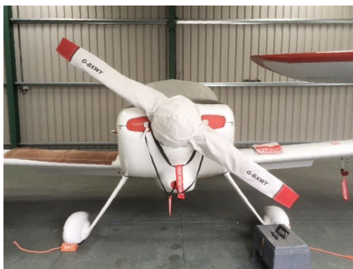
Van's RV-6 Prop/Spinner Cover

This cover type is made from Silver Acrylic Sunbrella canvas and is 100% lined with a soft and smooth microfiber. Bruce's Custom Covers developed this material combination especially for aircraft protection. The outer material is medium weight and treated for water resistance, UV resistance and anti-static buildup. The inner lining is a very soft and smooth microfiber to prevent scratching. The material is very reflective, and tests show that the cabin interior temperature can be reduced to near-ambient temperature on the hottest of days. It is water, ice and snow repellent, yet breathable to allow moisture to escape from between the cover and the aircraft surface.