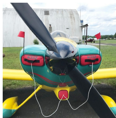
Van's Aircraft RV-4 Engine Inlet Plugs