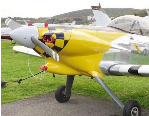
Vans RV-4 Engine Plugs

Engine Inlet Plugs are custom fit for your Van's Aircraft RV-4 intakes, made with heavy-duty vinyl material, and stuffed with a single block of sculpted urethane foam. Each plug has a zipper that allows the foam to be removed and dried if necessary. Engine plugs have warning flags that are visible from the cockpit or 'remove before flight' streamers sewn onto the face of the plugs. Most plugs are imprinted with the aircraft registration number in black for an extra charge. Storage bag NOT included. Engine plugs may be inserted after flight when the engine is still warm. Engine Inlet Plugs are commonly referred to as Cowl Plugs, Intake Plugs, Cowl Blocks, Engine Blocks, and Engine Bungs.