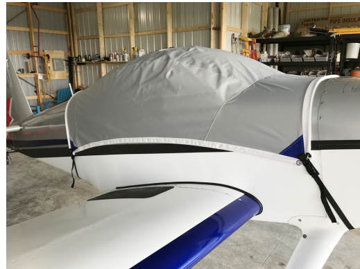
Van's Aircraft RV-9 Travel Cover, Light Weight Travel Canopy Cover