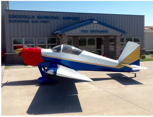
Van's RV-7 Insulated Engine Cover