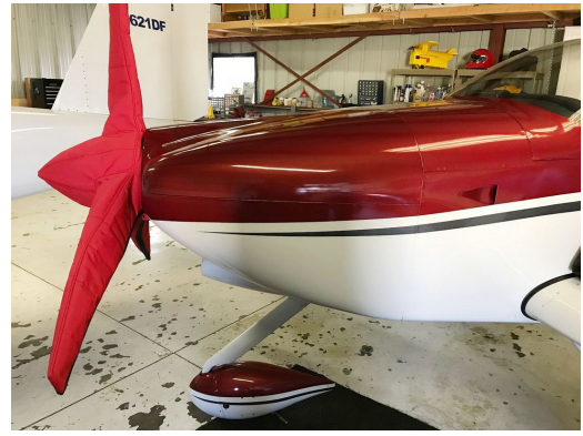
Van's RV-9 Insulated Prop Cover, 3-blade