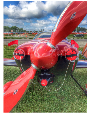
Van's RV-7 Engine Inlet Plugs