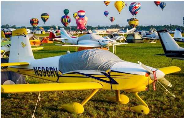
Vans's RV-9 Travel Weight Canopy Cover at Sun 'n Fun

Travel Covers are made with Silver Solution-Dyed Polyester fabric and only lined over the windshield to save weight. The material is lightweight and more compact for easy stowage in the aircraft. The polyester material is water resistant, but only intended for occasional use outside. We also have an ultra lightweight material available for fitted hangar dust covers. For daily outdoor use, the non-travel Sunbrella Cover is the best choice.