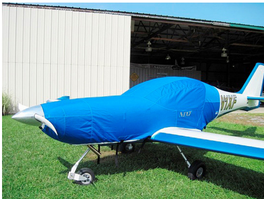
Arion Lightning Extended Canopy/Engine Cover

This cover type is made from Silver Acrylic Sunbrella canvas and is 100% lined with a soft and smooth microfiber. Bruce's Custom Covers developed this material combination especially for aircraft protection. The outer material is medium weight and treated for water resistance, UV resistance and anti-static buildup. The inner lining is a very soft and smooth microfiber to prevent scratching. The material is very reflective, and tests show that the cabin interior temperature can be reduced to near-ambient temperature on the hottest of days. It is water, ice and snow repellent, yet breathable to allow moisture to escape from between the cover and the aircraft surface.