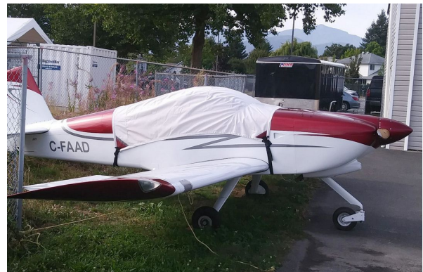
Van's RV-6 Canopy Cover