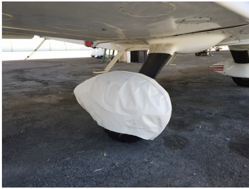
Grumman AA5 Main Wheelpant Cover, test fit