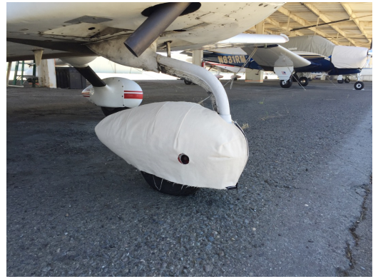
Grumman AA5 Nose Wheelpant Cover, test fit