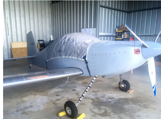
Van's RV-7 Travel Cover, Light Weight Canopy Cover