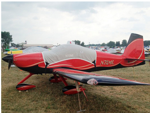
Van's RV-7 Canopy Cover

This cover type is made from Silver Acrylic Sunbrella canvas and is 100% lined with a soft and smooth microfiber. Bruce's Custom Covers developed this material combination especially for aircraft protection. The outer material is medium weight and treated for water resistance, UV resistance and anti-static buildup. The inner lining is a very soft and smooth microfiber to prevent scratching. The material is very reflective, and tests show that the cabin interior temperature can be reduced to near-ambient temperature on the hottest of days. It is water, ice and snow repellent, yet breathable to allow moisture to escape from between the cover and the aircraft surface.