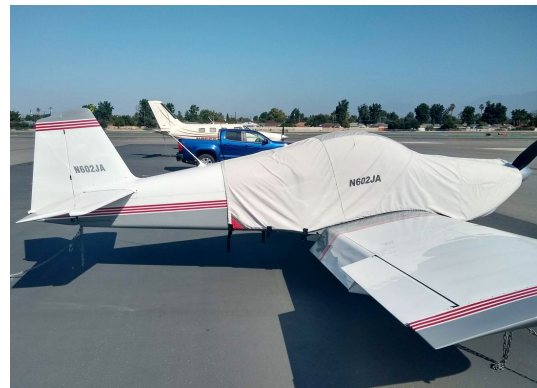
Van's RV-6 Extended Canopy/Engine Cover