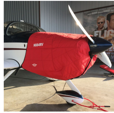
Van's RV-9A Insulated Engine Cover