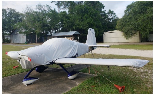
Van's RV-7A Cover Set