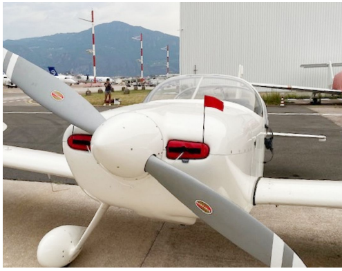
Van's RV7/7A Engine Inlet Plugs