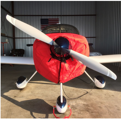
Van's RV-9A Insulated Engine Cover