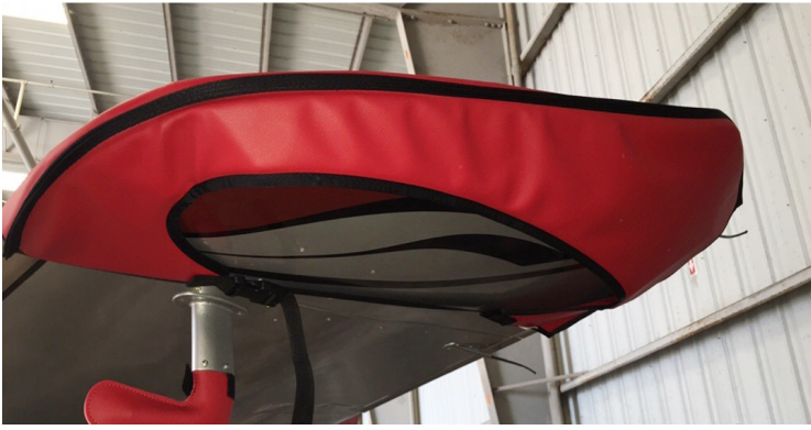
Cirrus SR-20/22 Wingtip Pads