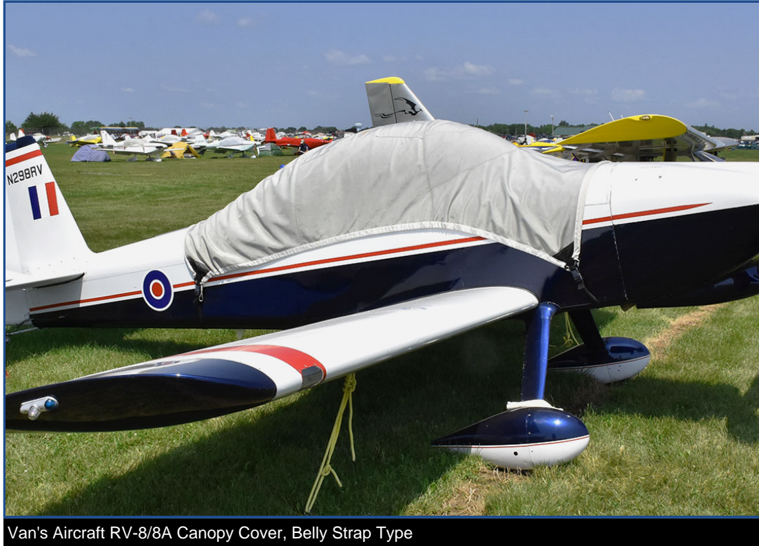
Van's Aircraft RV-8/8A Canopy Cover, Belly Strap Type