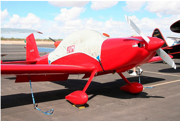
Van's RV-8 Canopy Cover

This cover type is made from Silver Acrylic Sunbrella canvas and is 100% lined with a soft and smooth microfiber. Bruce's Custom Covers developed this material combination especially for aircraft protection. The outer material is medium weight and treated for water resistance, UV resistance and anti-static buildup. The inner lining is a very soft and smooth microfiber to prevent scratching. The material is very reflective, and tests show that the cabin interior temperature can be reduced to near-ambient temperature on the hottest of days. It is water, ice and snow repellent, yet breathable to allow moisture to escape from between the cover and the aircraft surface.