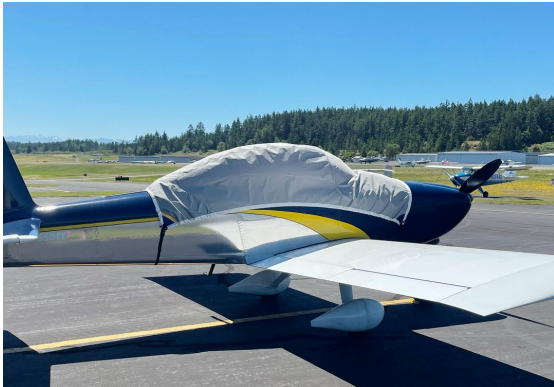
RV-8A Travel Canopy Cover

Travel Covers are made with Silver Solution-Dyed Polyester fabric and only lined over the windshield to save weight. The material is lightweight and more compact for easy stowage in the aircraft. The polyester material is water resistant, but only intended for occasional use outside. We also have an ultra lightweight material available for fitted hangar dust covers. For daily outdoor use, the non-travel Sunbrella Cover is the best choice.