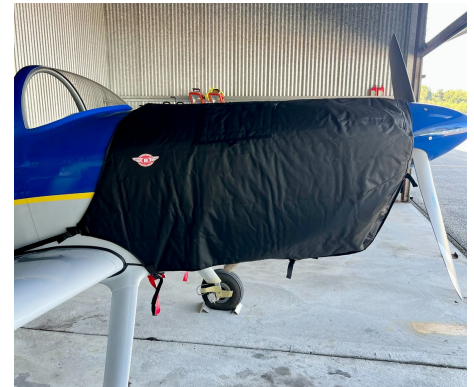
Van's RV8 Insulated Engine Cover