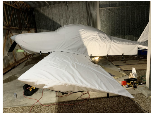
Van's RV-8 Complete Fuselage Cover with Detachable Wing Covers