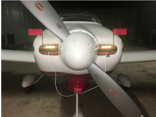
Van's Aircraft RV-7A Engine Inlet Plugs

Engine Inlet Plugs are custom fit for your Van's Aircraft RV-8/8A intakes, made with heavy-duty vinyl material, and stuffed with a single block of sculpted urethane foam. Each plug has a zipper that allows the foam to be removed and dried if necessary. Engine plugs have warning flags that are visible from the cockpit or 'remove before flight' streamers sewn onto the face of the plugs. Most plugs are imprinted with the aircraft registration number in black for an extra charge. Storage bag NOT included. Engine plugs may be inserted after flight when the engine is still warm. Engine Inlet Plugs are commonly referred to as Cowl Plugs, Intake Plugs, Cowl Blocks, Engine Blocks, and Engine Bungs.