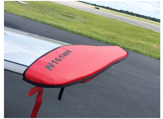
Cirrus SR-20/22 Wingtip Pads