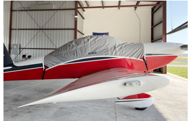
Van's RV-8 Travel Weight Canopy Cover