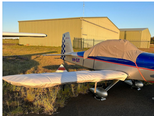
Van's Aircraft RV-8/8A Wing Covers, All Year Use

WINTER USE MATERIAL - Made with Solution-Dyed Polyester fabric, this option is intended for seasonal use to aid in deicing, rain mitigation, or for occasional travel. The material is lighter and more compact, but more susceptible to UV damage and may have a shorter useful life if used continuously outside than the all-year use material.