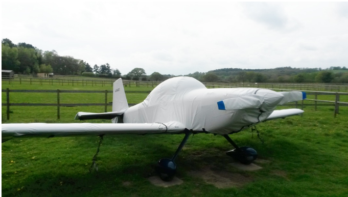
Van's RV-8 Complete Fuselage Cover w/ Detachable Wing Covers & Prop Cover

This cover type is made from Silver Acrylic Sunbrella canvas and is 100% lined with a soft and smooth microfiber. Bruce's Custom Covers developed this material combination especially for aircraft protection. The outer material is medium weight and treated for water resistance, UV resistance and anti-static buildup. The inner lining is a very soft and smooth microfiber to prevent scratching. The material is very reflective, and tests show that the cabin interior temperature can be reduced to near-ambient temperature on the hottest of days. It is water, ice and snow repellent, yet breathable to allow moisture to escape from between the cover and the aircraft surface.