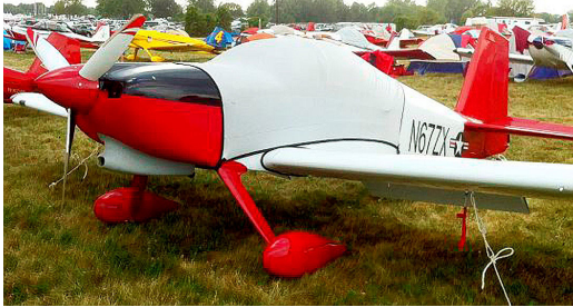
Light Weight Fitted Hangar Dust Cover