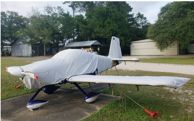
Van's RV-7A Cover Set

WINTER USE MATERIAL - Made with Solution-Dyed Polyester fabric, this option is intended for seasonal use to aid in deicing, rain mitigation, or for occasional travel. The material is lighter and more compact, but more susceptible to UV damage and may have a shorter useful life if used continuously outside than the all-year use material.