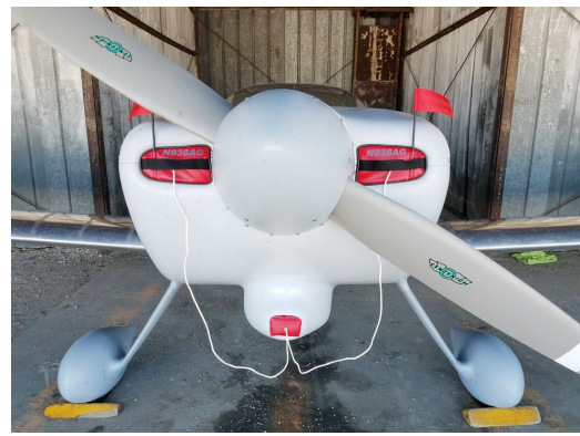
Van's RV-9 Engine Inlet Plugs