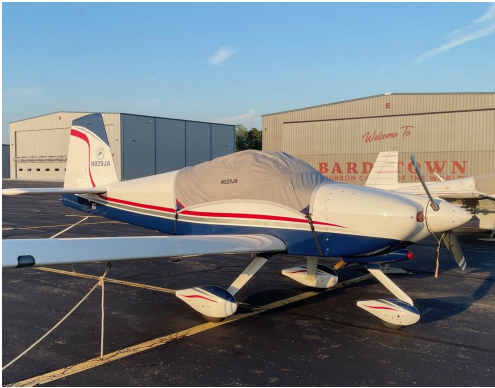
RV-9/9A Travel Cover, light weight canopy cover

occasional use outside. We also have an ultra lightweight material available for fitted hangar dust covers. For daily outdoor use, the non-travel Sunbrella Cover is the best choice.