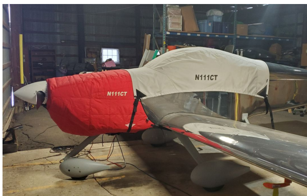
Van's RV-9 Insulated Engine Cover