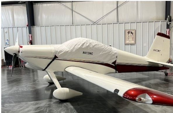
Van's Aircraft RV-9 Canopy Cover