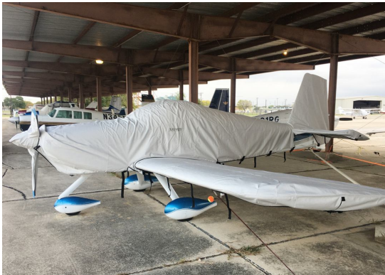
Van's RV-7A Complete Cover Set

This cover type is made from Silver Acrylic Sunbrella canvas and is 100% lined with a soft and smooth microfiber. Bruce's Custom Covers developed this material combination especially for aircraft protection. The outer material is medium weight and treated for water resistance, UV resistance and anti-static buildup. The inner lining is a very soft and smooth microfiber to prevent scratching. The material is very reflective, and tests show that the cabin interior temperature can be reduced to near-ambient temperature on the hottest of days. It is water, ice and snow repellent, yet breathable to allow moisture to escape from between the cover and the aircraft surface.