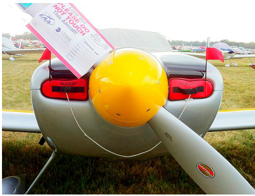
Vans's RV-7 Engine Engine Inlet Plugs