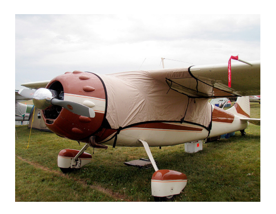
Cessna 195 Canopy Cover, extended forward and over gas caps