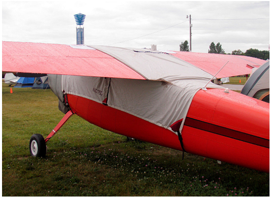
Over-Top Canopy Cover & Engine Cover