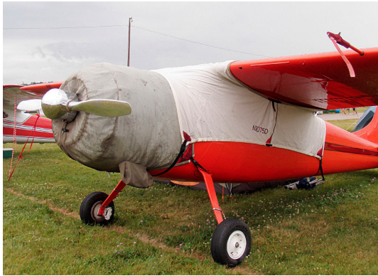
Cessna 195 Over-Top Canopy Cover & Engine Cover

The material is very reflective, and tests show that the cabin interior temperature can be reduced to near-ambient temperature on the hottest of days. It is water, ice and snow repellent, yet breathable to allow moisture to escape from between the cover and the aircraft surface.