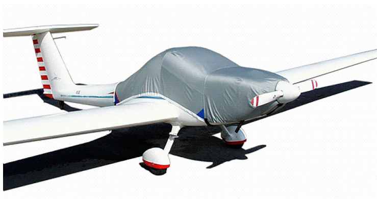
Grob 109 Canopy/Engine Cover