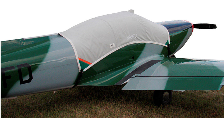
Standard Canopy Cover