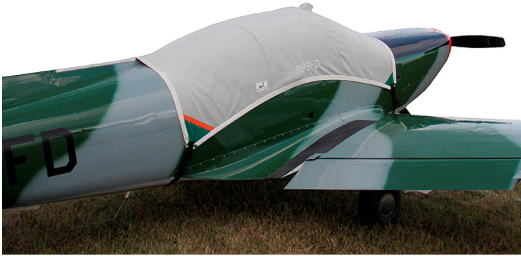
Standard Canopy Cover

Travel Covers are made with Silver Solution-Dyed Polyester fabric and only lined over the windshield to save weight. The material is lightweight and more compact for easy stowage in the aircraft. The polyester material is water resistant, but only intended for occasional use outside. We also have an ultra lightweight material available for fitted hangar dust covers. For daily outdoor use, the non-travel Sunbrella Cover is the best choice.