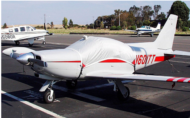
Standard Canopy Cover for Marchetti SF260

This cover type is made from Silver Acrylic Sunbrella canvas and is 100% lined with a soft and smooth microfiber. Bruce's Custom Covers developed this material combination especially for aircraft protection. The outer material is medium weight and treated for water resistance, UV resistance and anti-static buildup. The inner lining is a very soft and smooth microfiber to prevent scratching. The material is very reflective, and tests show that the cabin interior temperature can be reduced to near-ambient temperature on the hottest of days. It is water, ice and snow repellent, yet breathable to allow moisture to escape from between the cover and the aircraft surface.