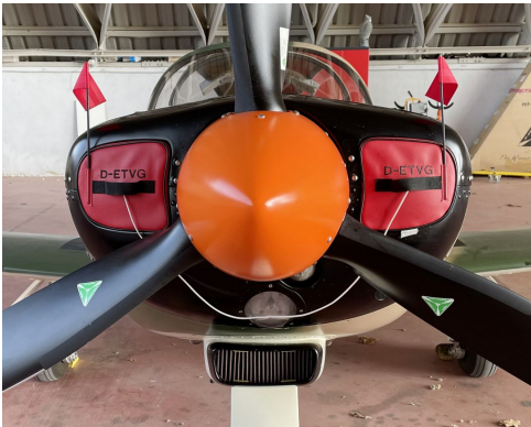
Marcheti SF260C Inlet Plugs

Engine Inlet Plugs are custom fit for your Siai Marchetti SF260 intakes, made with heavy-duty vinyl material, and stuffed with a single block of sculpted urethane foam. Each plug has a zipper that allows the foam to be removed and dried if necessary. Engine plugs have warning flags that are visible from the cockpit or 'remove before flight' streamers sewn onto the face of the plugs. Most plugs are imprinted with the aircraft registration number in black for an extra charge. Storage bag NOT included. Engine plugs may be inserted after flight when the engine is still warm. Engine Inlet Plugs are commonly referred to as Cowl Plugs, Intake Plugs, Cowl Blocks, Engine Blocks, and Engine Bungs.