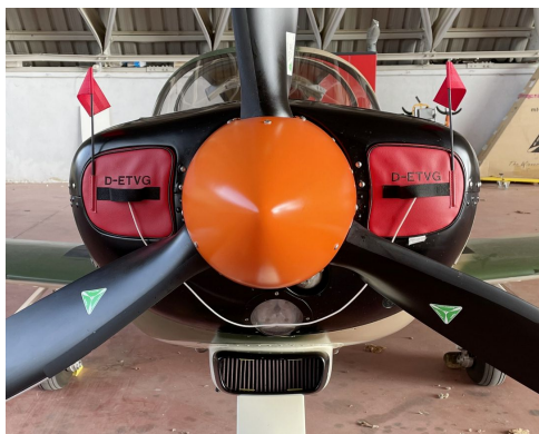
Marcheti SF260C Inlet Plugs

Engine Inlet Plugs are custom fit for your SiAi Marchetti SF260 intakes, made with heavy-duty vinyl material, and stuffed with a single block of sculpted urethane foam. Each plug has a zipper that allows the foam to be removed and dried if necessary. Engine plugs have warning flags that are visible from the cockpit or 'remove before flight' streamers sewn onto the face of the plugs. Most plugs are imprinted with the aircraft registration number in black for an extra charge. Storage bag NOT included. Engine plugs may be inserted after flight when the engine is still warm. Engine Inlet Plugs are commonly referred to as Cowl Plugs, Intake Plugs, Cowl Blocks, Engine Blocks, and Engine Bungs.