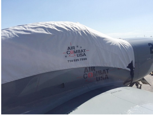
1974 Siai-Marchetti SF 260B Canopy Cover with customized Imprint

This cover type is made from Silver Acrylic Sunbrella canvas and is 100% lined with a soft and smooth microfiber. Bruce's Custom Covers developed this material combination especially for aircraft protection. The outer material is medium weight and treated for water resistance, UV resistance and anti-static buildup. The inner lining is a very soft and smooth microfiber to prevent scratching. The material is very reflective, and tests show that the cabin interior temperature can be reduced to near-ambient temperature on the hottest of days. It is water, ice and snow repellent, yet breathable to allow moisture to escape from between the cover and the aircraft surface.