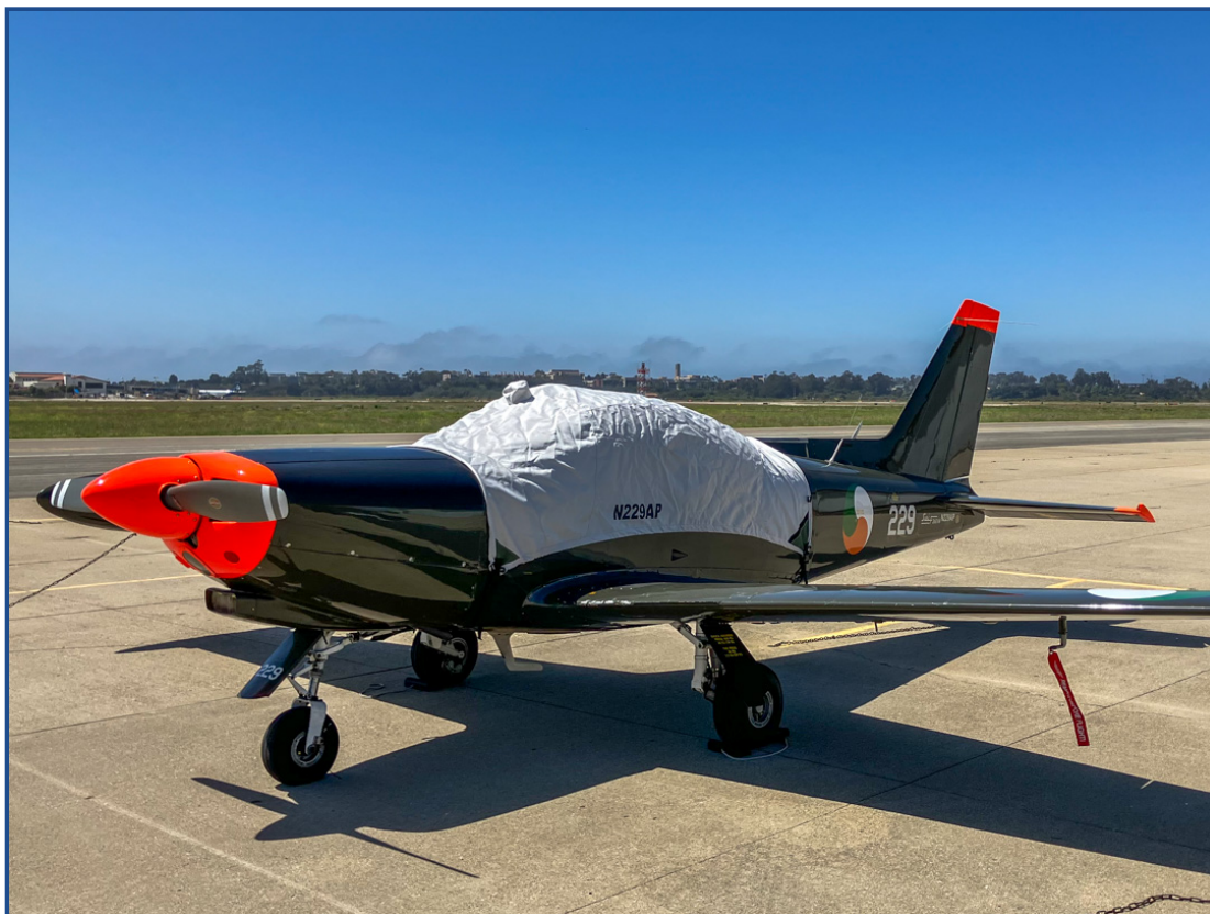
Siai Marchetti SF260 Canopy Cover