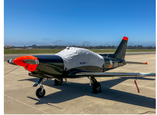
Siai Marchetti SF260 Canopy Cover