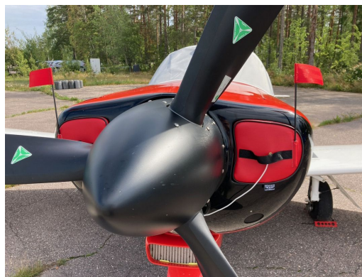
Siai Marchetti SF260 Engine Plugs