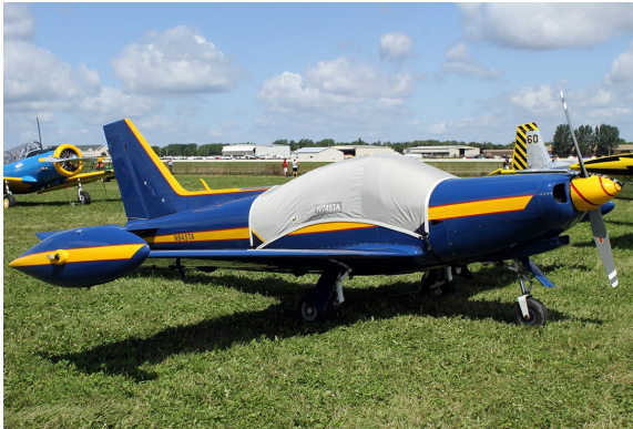
Siai Marchetti SF260 Canopy Cover

Travel Covers are made with Silver Solution-Dyed Polyester fabric and only lined over the windshield to save weight. The material is lightweight and more compact for easy stowage in the aircraft. The polyester material is water resistant, but only intended for occasional use outside. We also have an ultra lightweight material available for fitted hangar dust covers. For daily outdoor use, the non-travel Sunbrella Cover is the best choice.