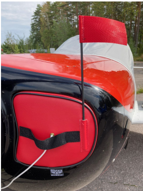
Siai Marchetti SF260 Engine Plugs