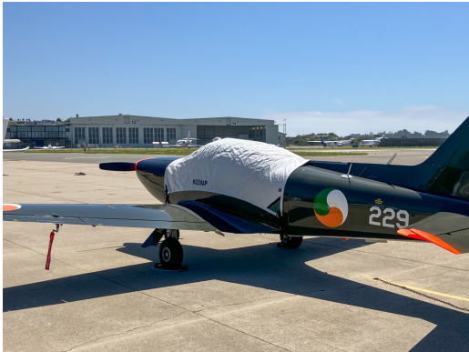
Siai Marchetti SF260 Canopy Cover